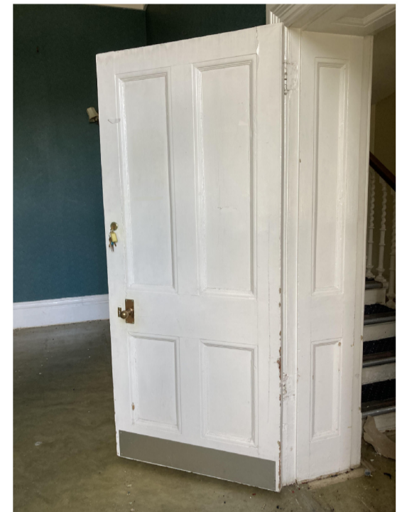
Image 1: Leaf Replacement (Historic) Proposed doors will match existing paneled door in G15 Final Specification TBC