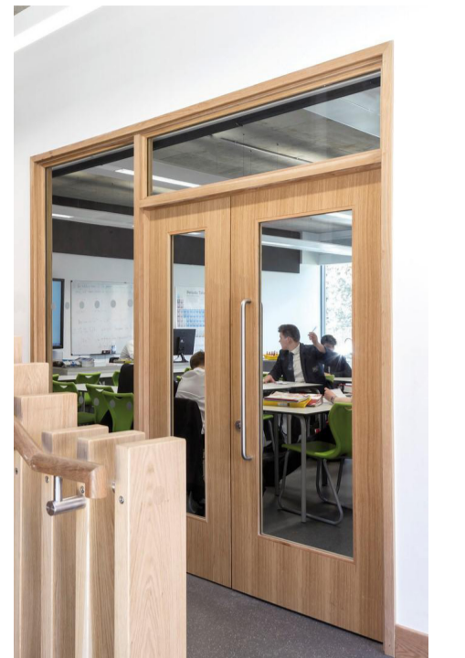
Image 2: Leaf Replacement (Contemporary) Proposed doors are a contemporary appearance with glazed screens Final Specification/Finish TBC