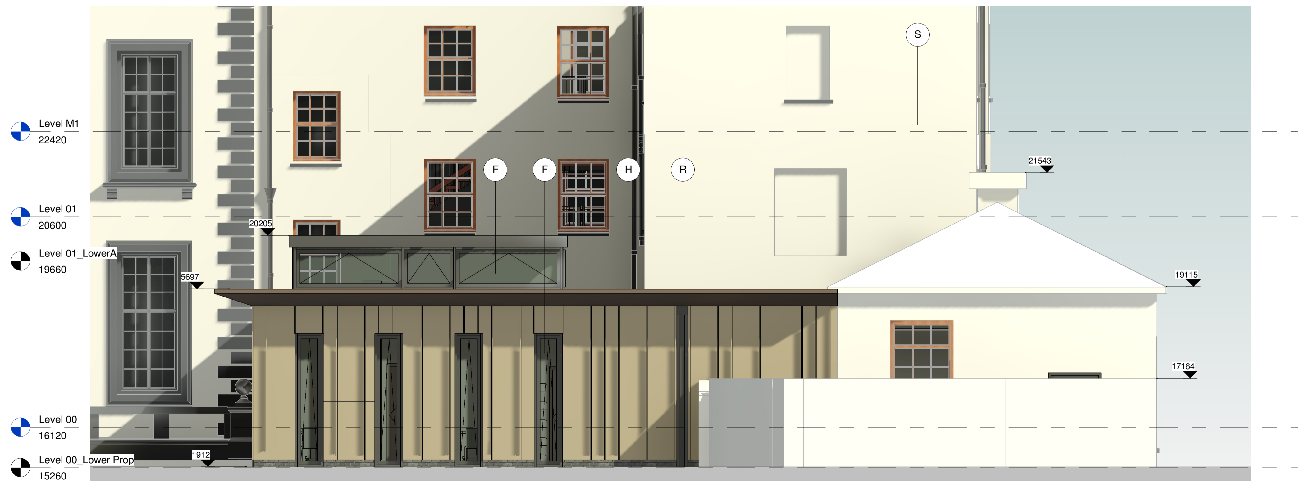
2 EXTENSION - EAST ELEVATION PROPOSED 1 : 50