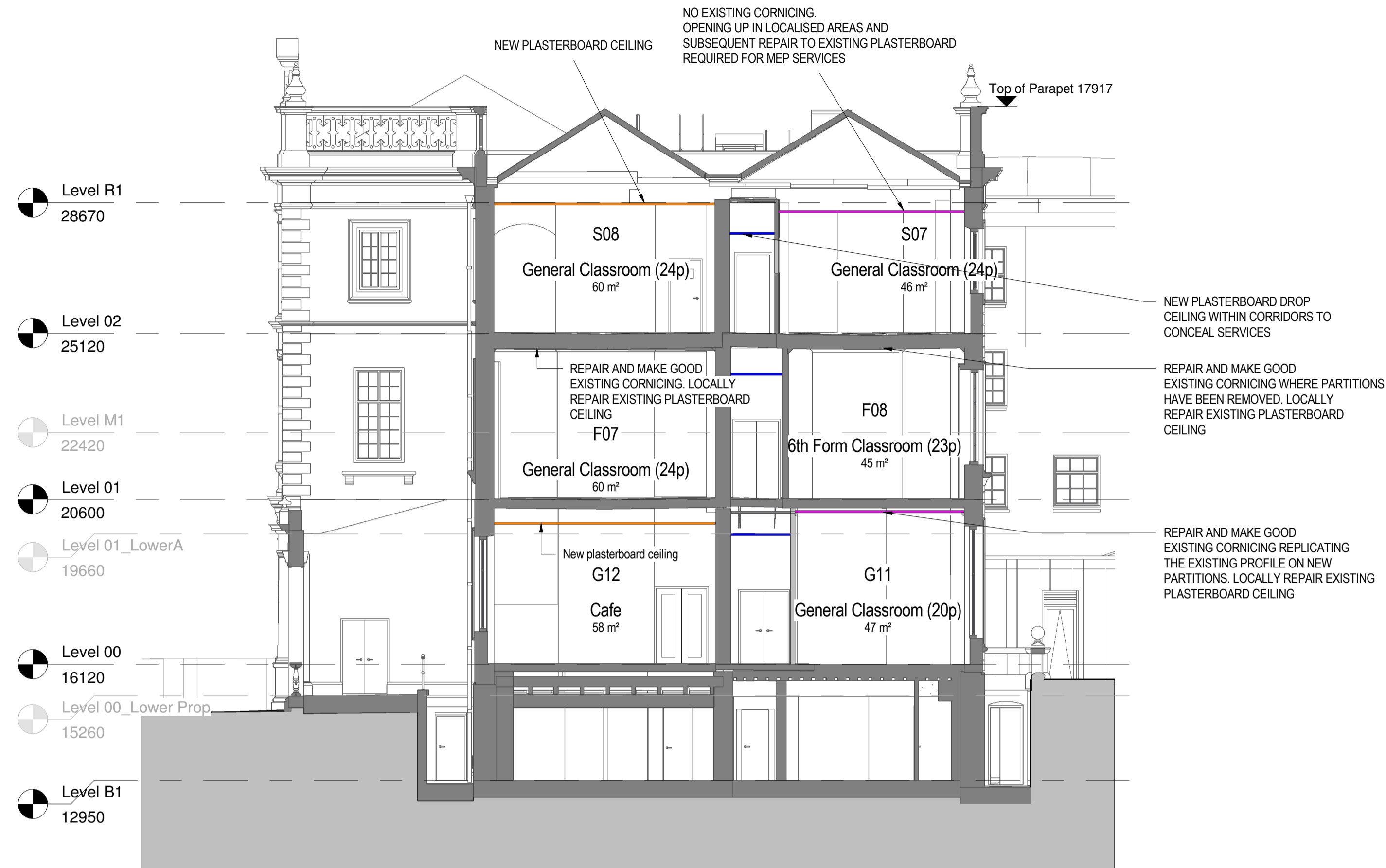
1 SECTION CC 1 : 100