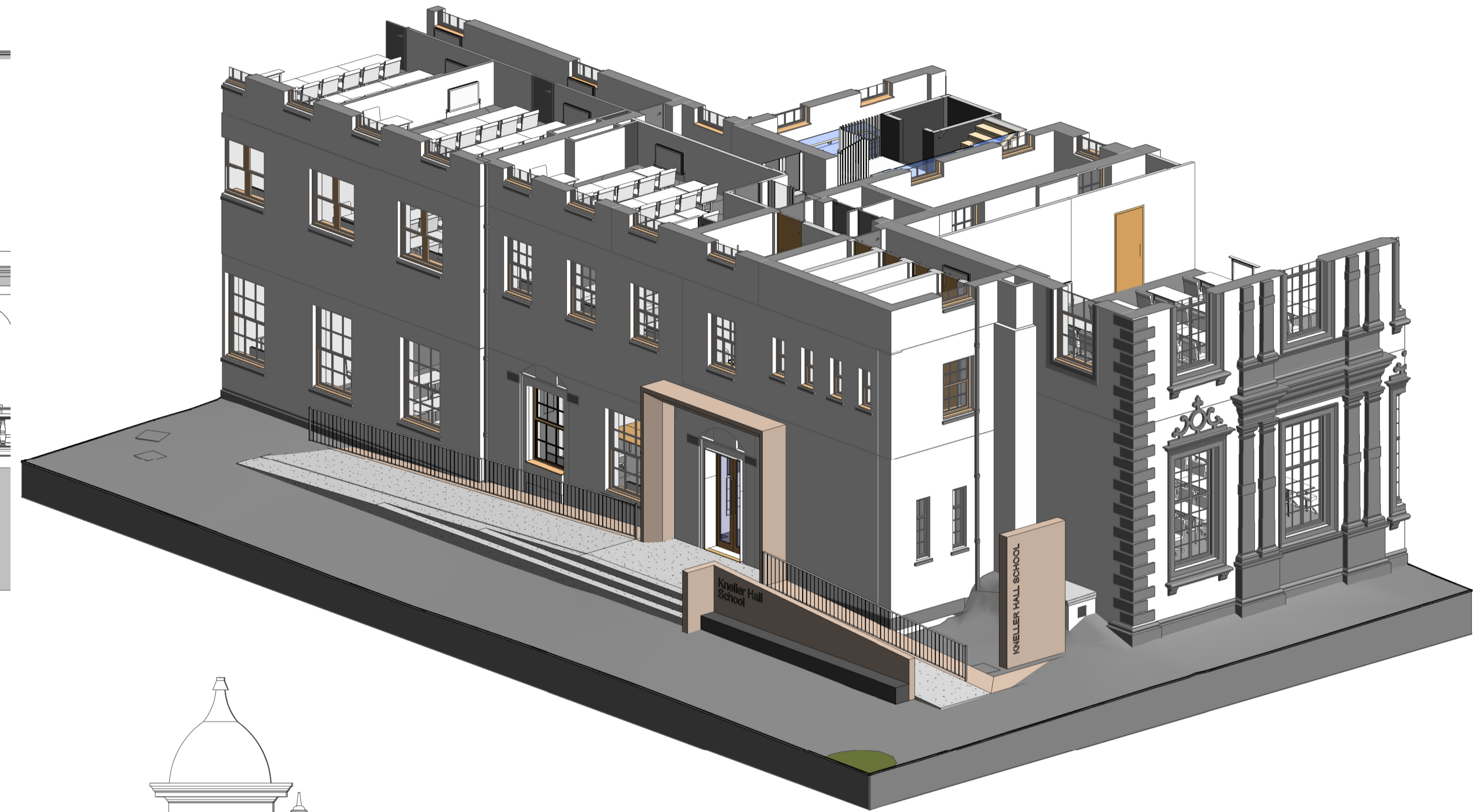
4 ENTRANCE 3D VIEW