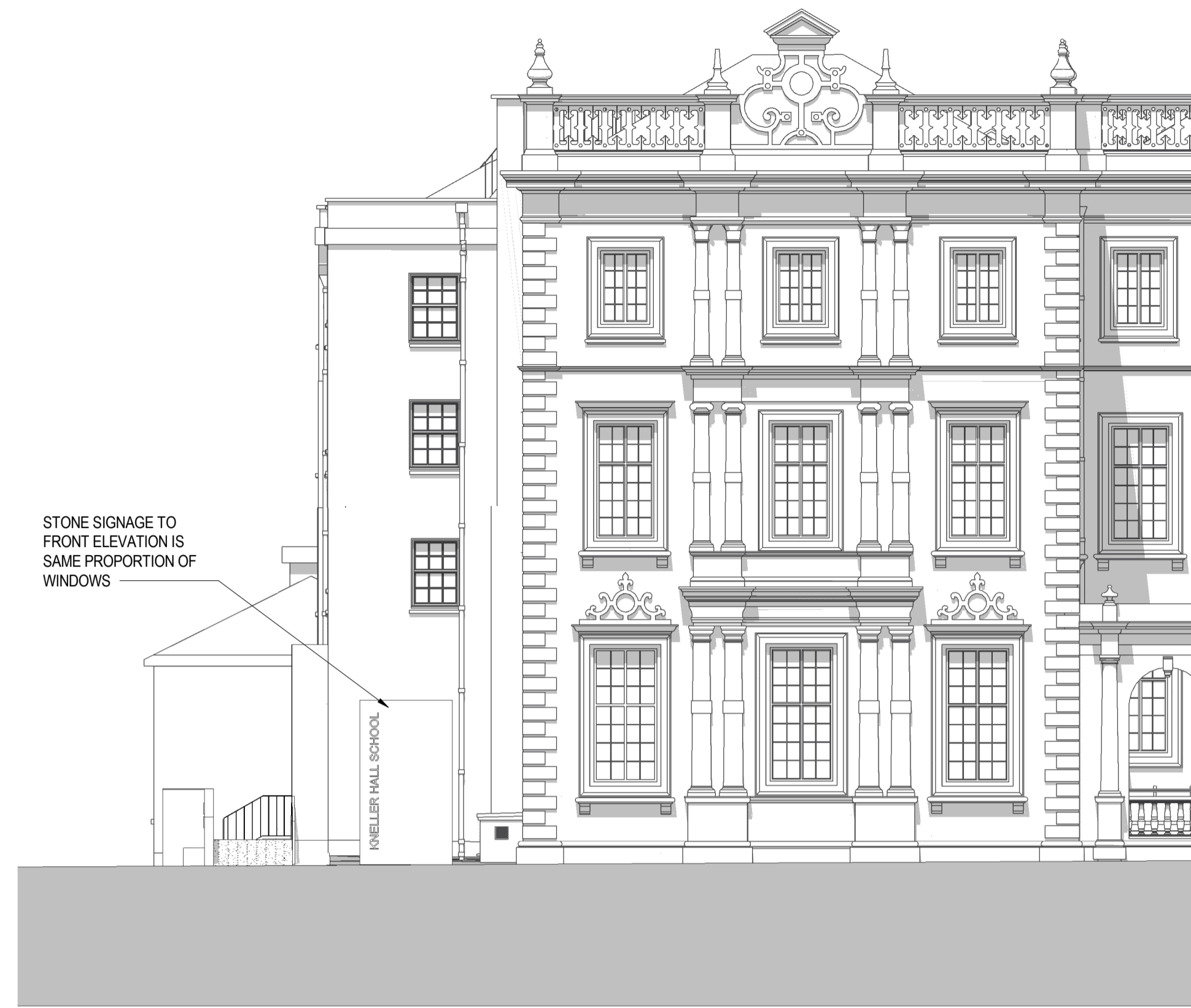
2 SOUTH ELEVATION 1 : 100