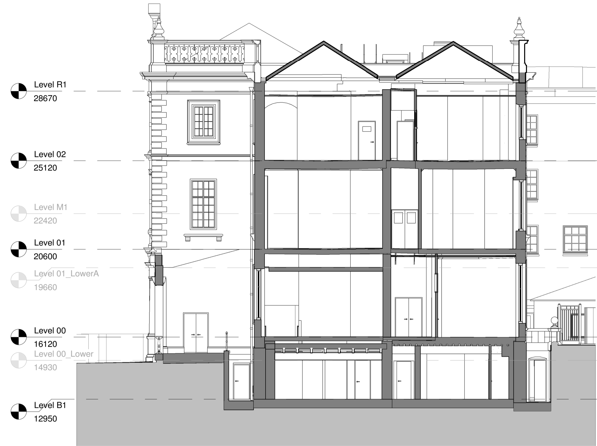
1 SECTION CC - EXISTING 1 : 100