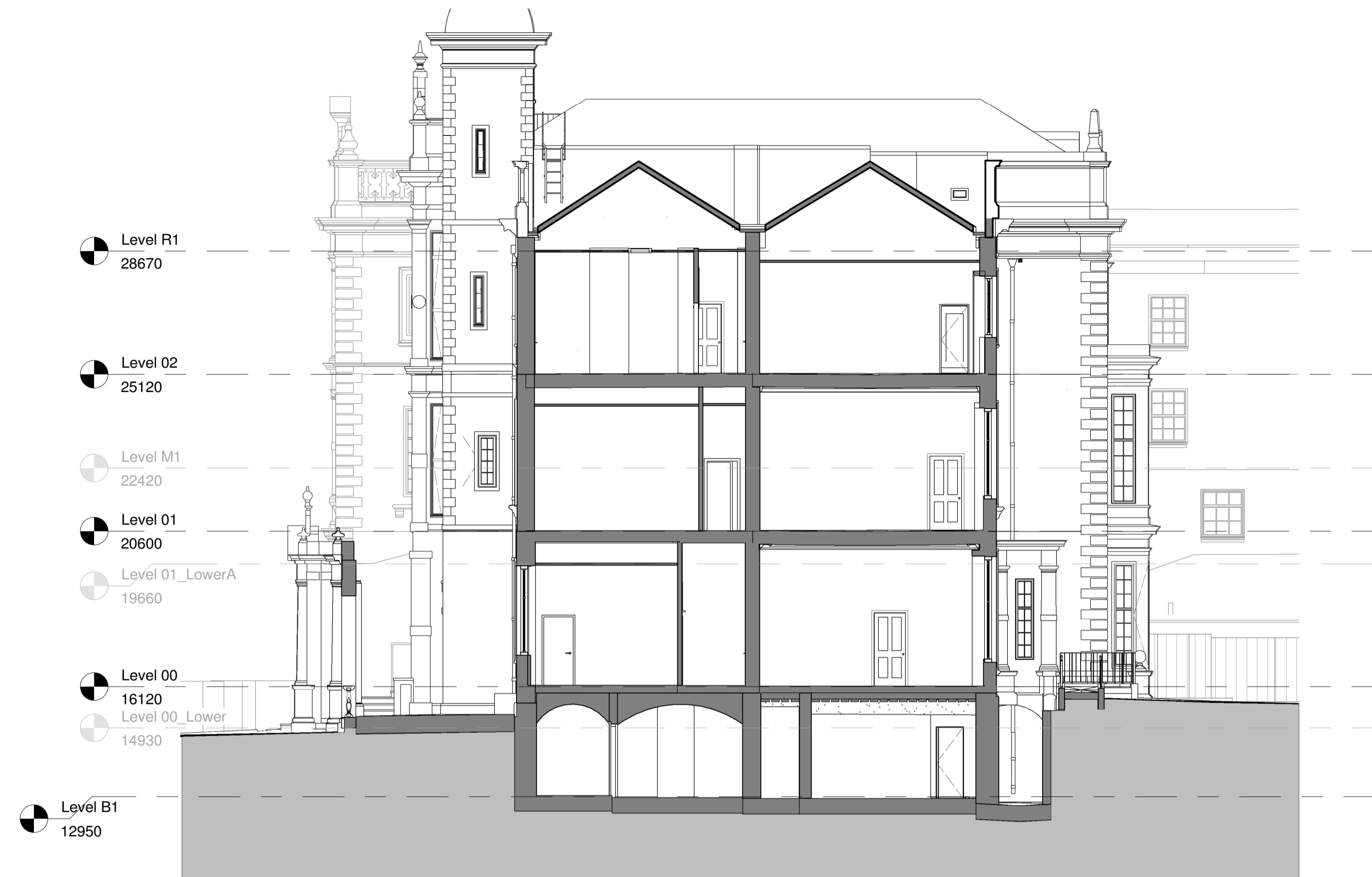
1 SECTION EE - EXISTING 1 : 100