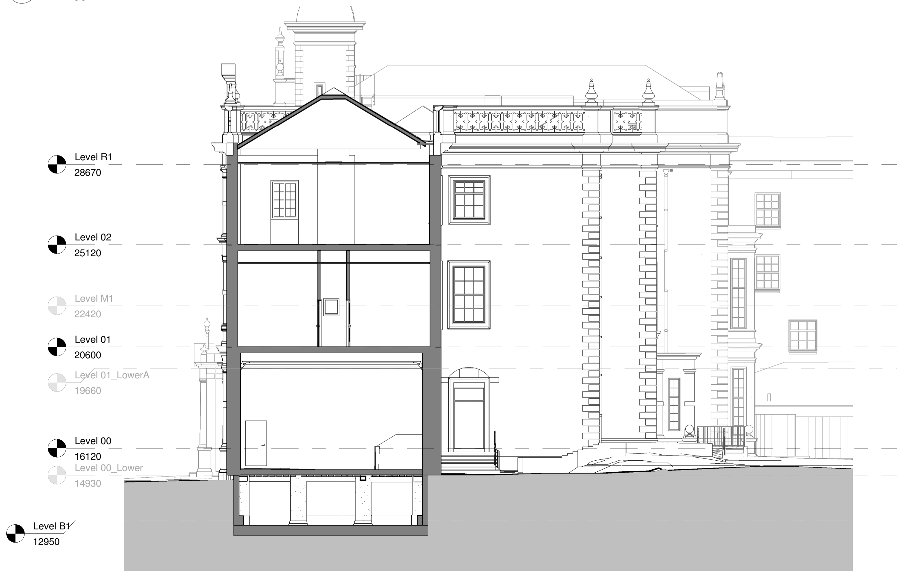
2 SECTION FF - EXISTING 1 : 100