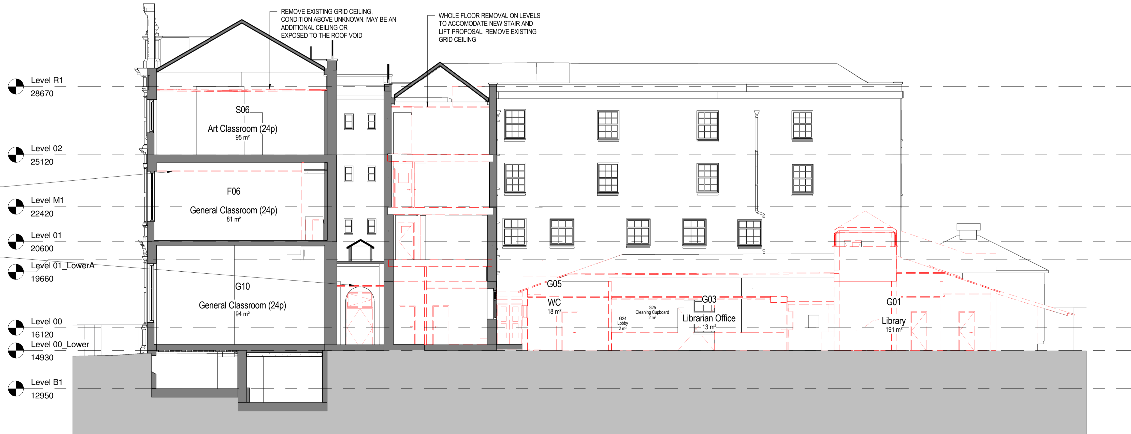
2. SECTION BB - DEMOLISHED 1 : 100