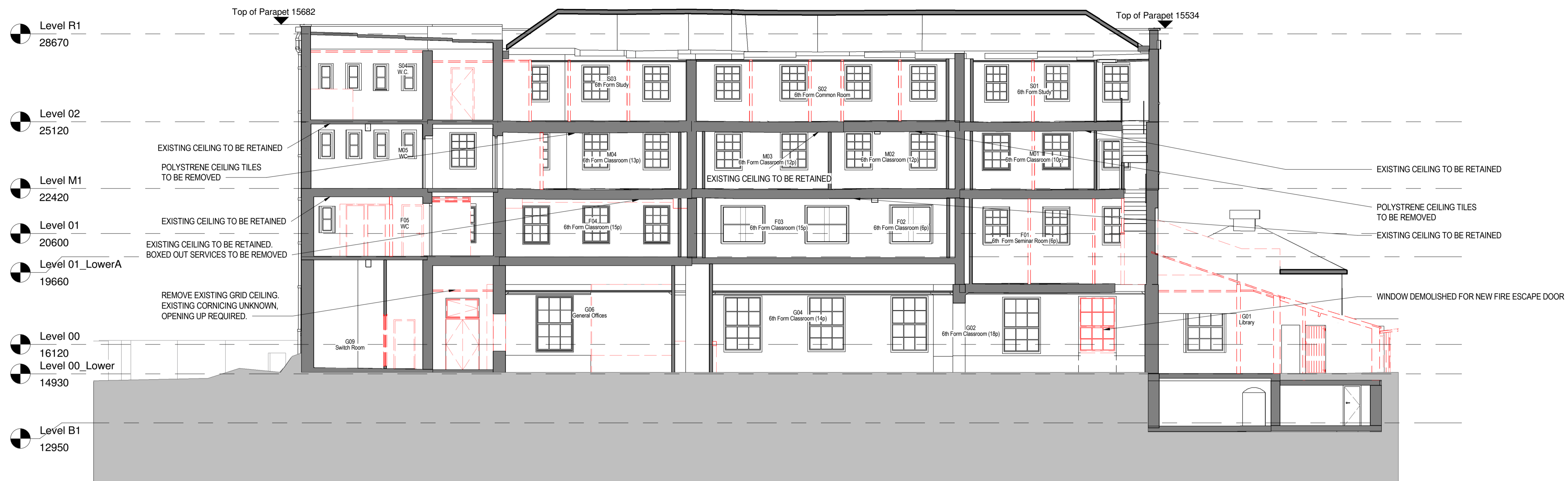
1. SECTION AA - DEMOLISHED 1 : 100