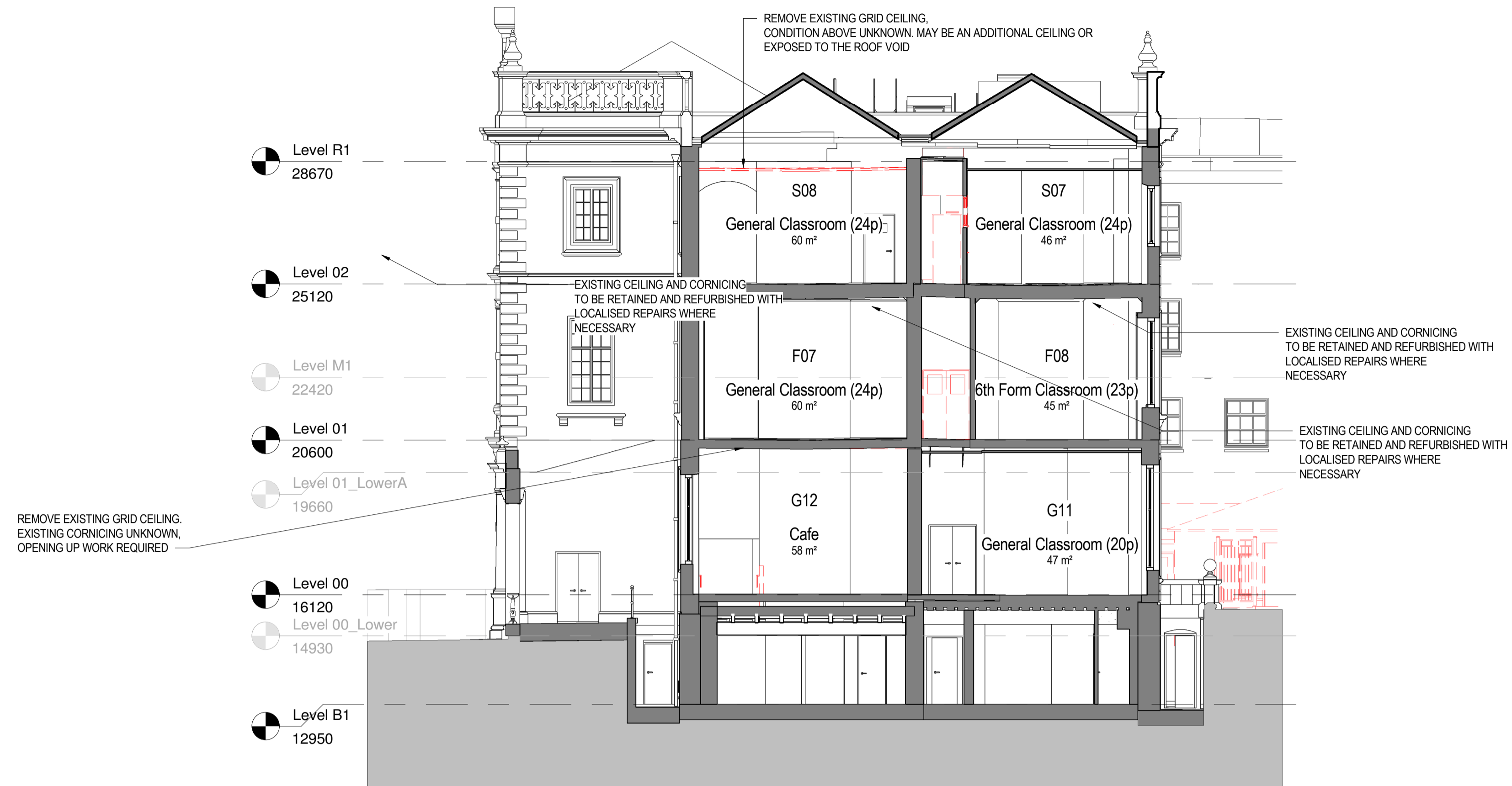
1 SECTION CC - DEMOLISHED 1 : 100