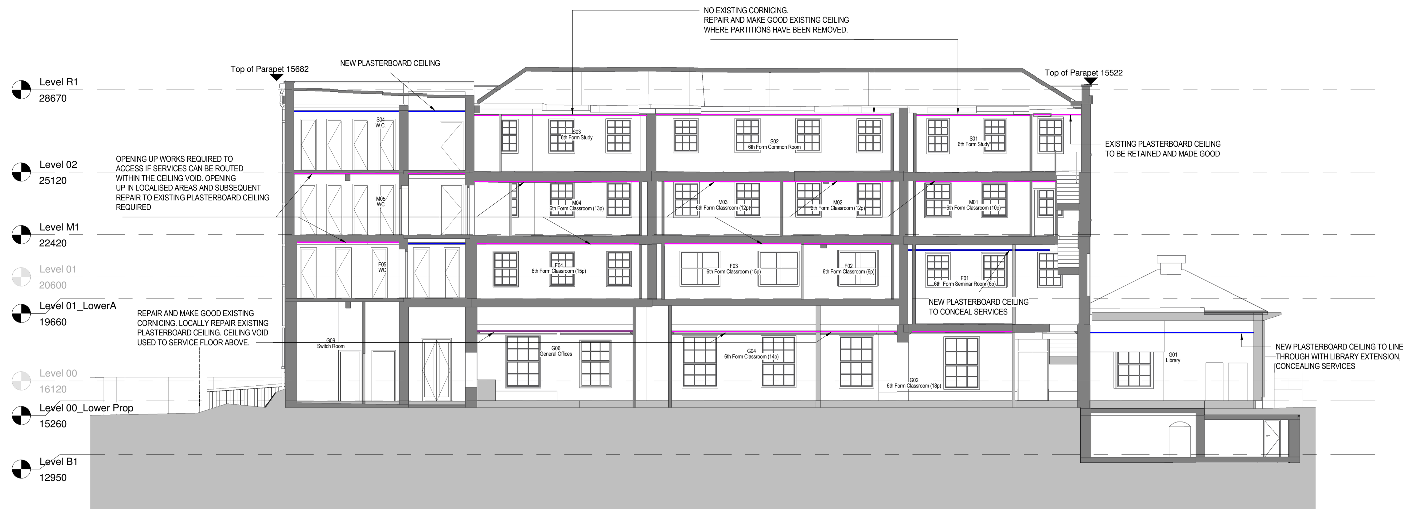
1 SECTION AA 1 : 100