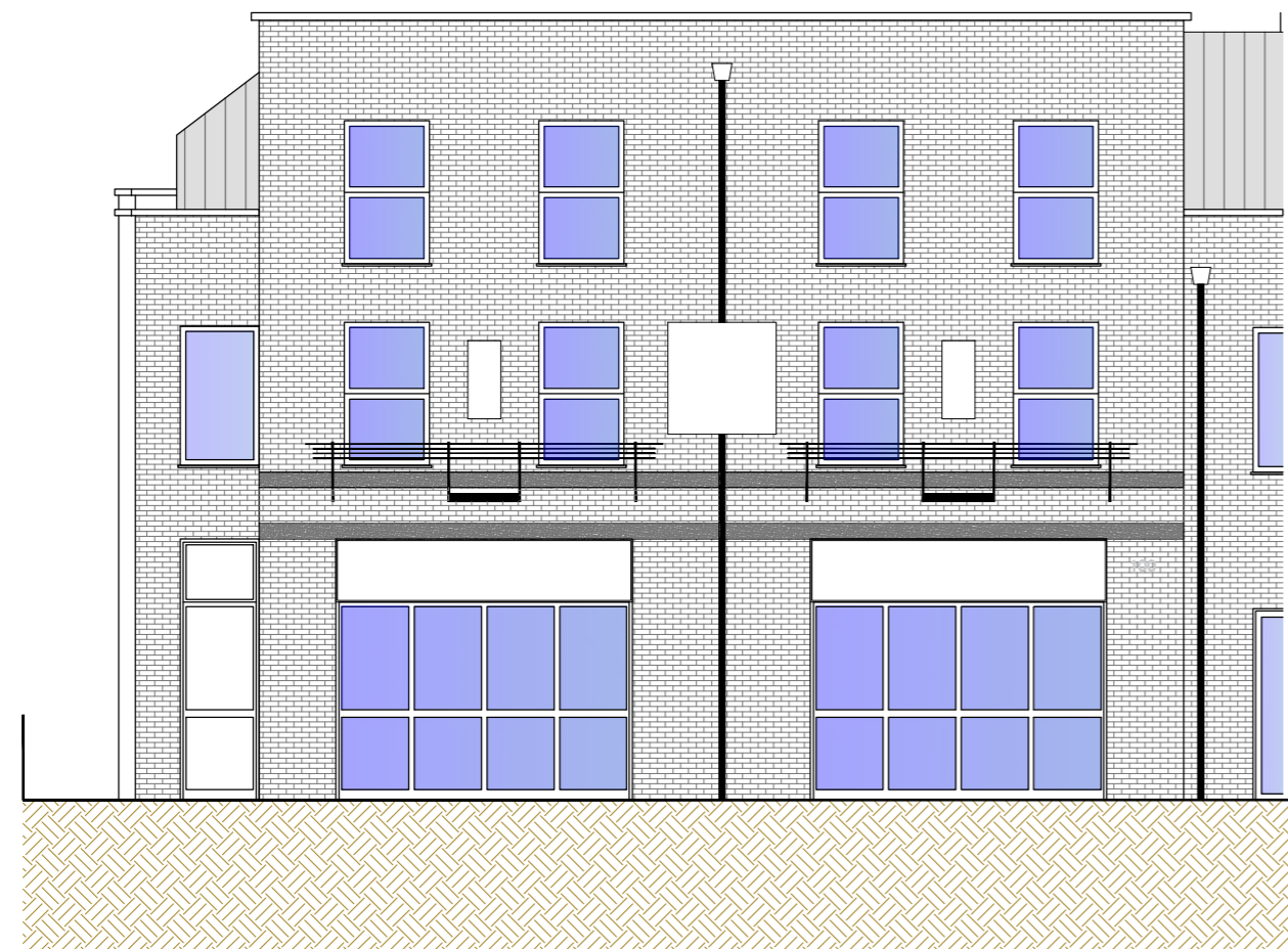
EXISTING FRONT ELEVATION - North Flank