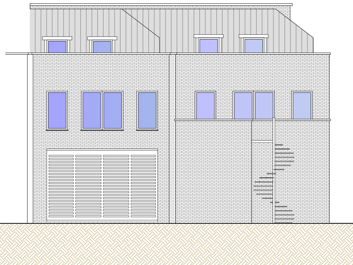
EXISTING REAR ELEVATION - South Flank