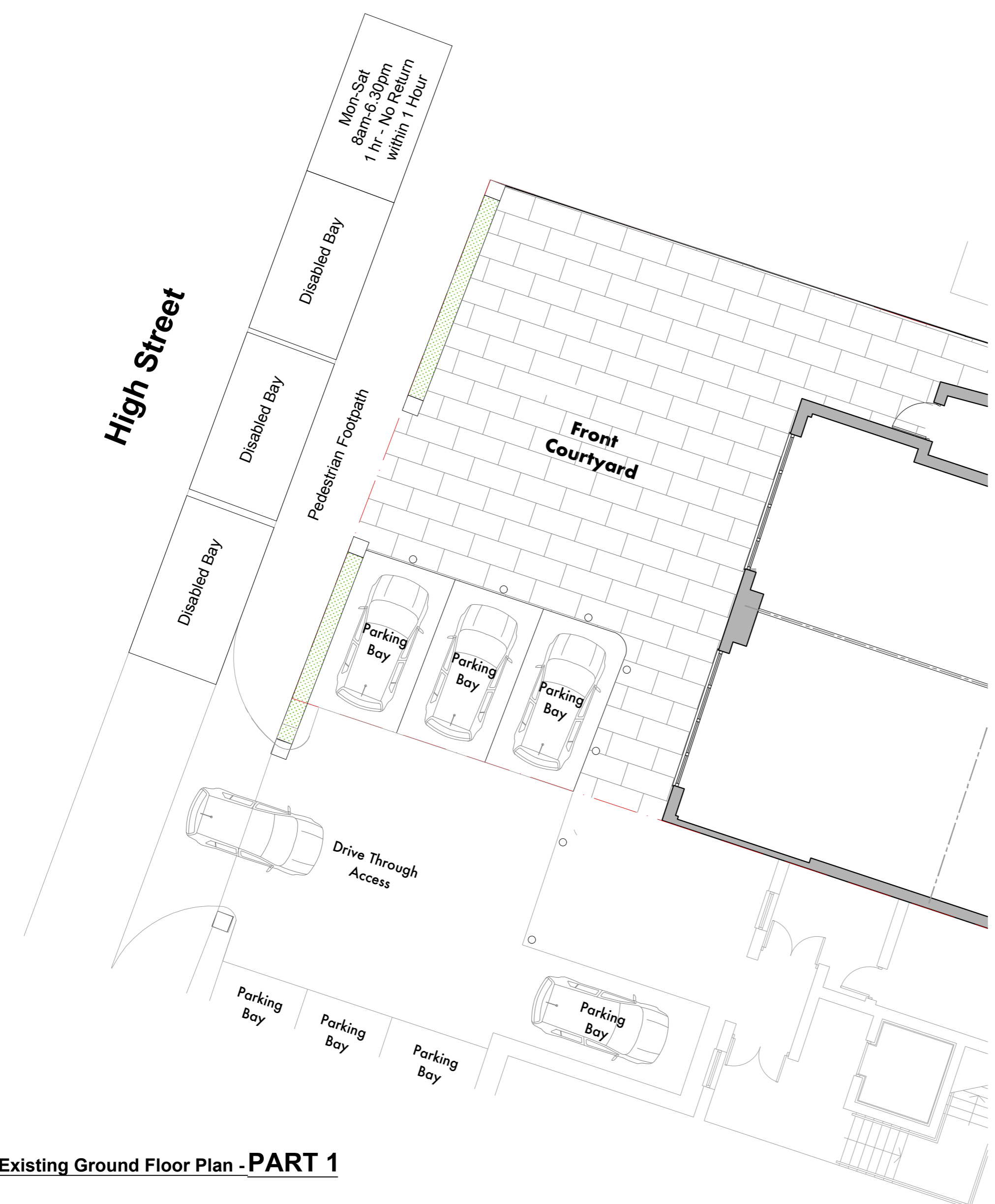
Existing Ground Floor Plan - PART 1