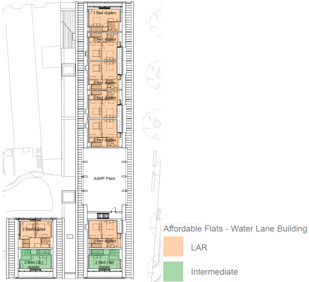
Figure 3. Proposed Affordable Housing on Level 3