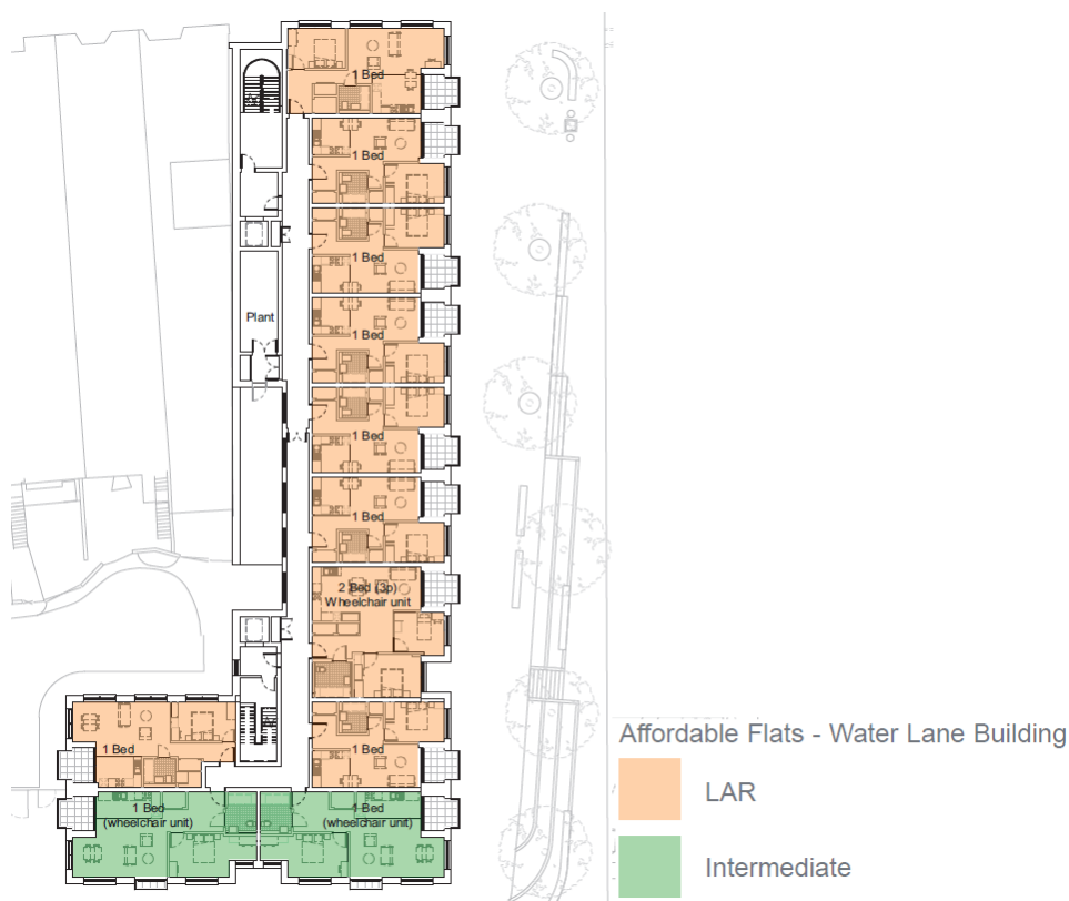
Figure 1. Proposed Affordable Housing on Level 1

3.6 The proposed affordable housing is distributed throughout the Water Lane building, as shown in Figure 1 below.