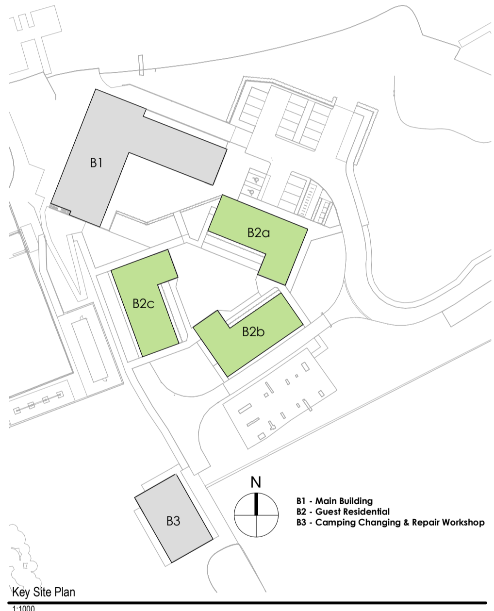
Key Site Plan 1:1000