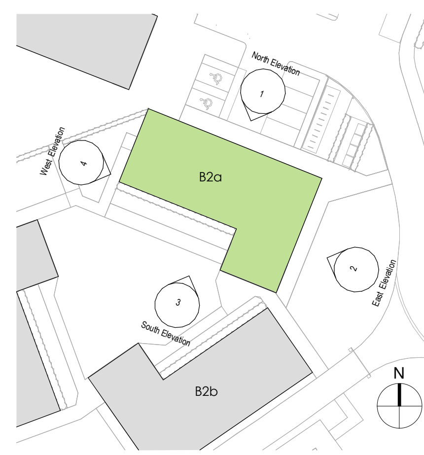
Key Site Plan 1:500