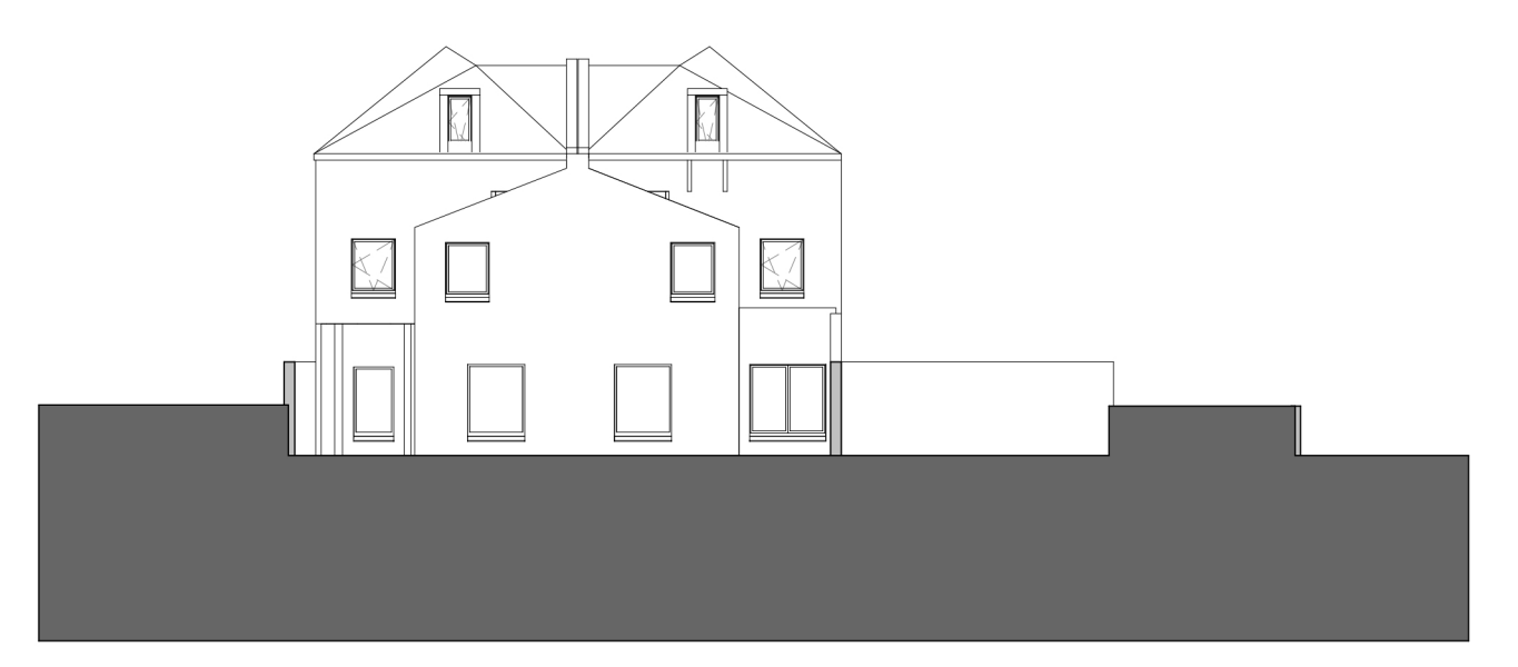
Existing Section C through garden and 47a 1:200