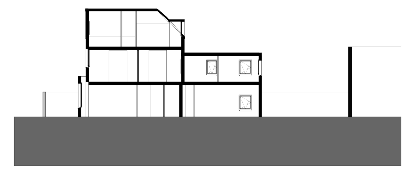
Existing Section D through 47 1: 200