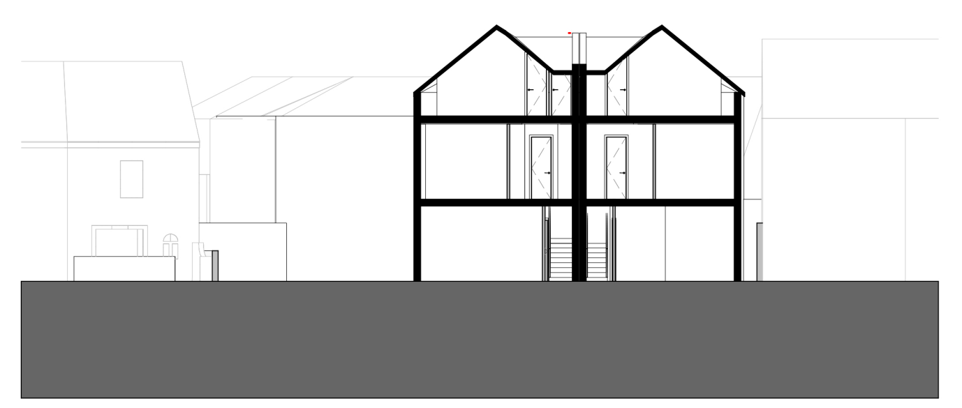
Existing Section A through 47a, 47 and 49 1 : 200