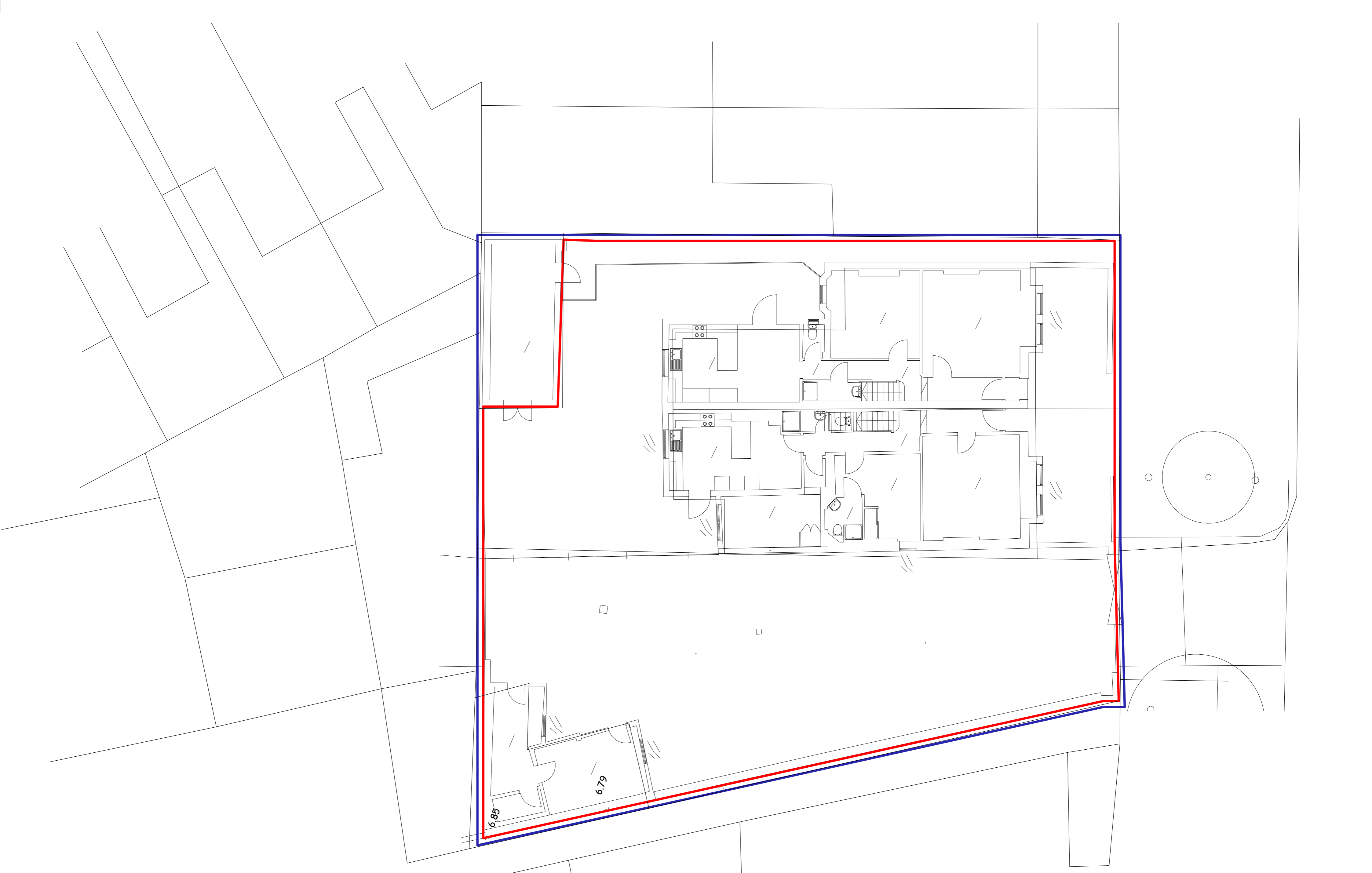
47a, 47 & 49 Lower Mortlake Road Existing Ground Floor Plan