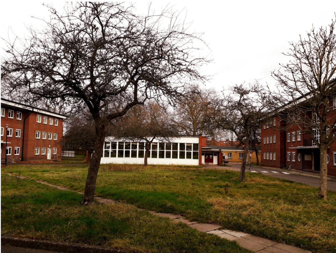
Fig 20 Kneller Hall area, western part of site, looking north towards the new “Sport Centre with Pool”