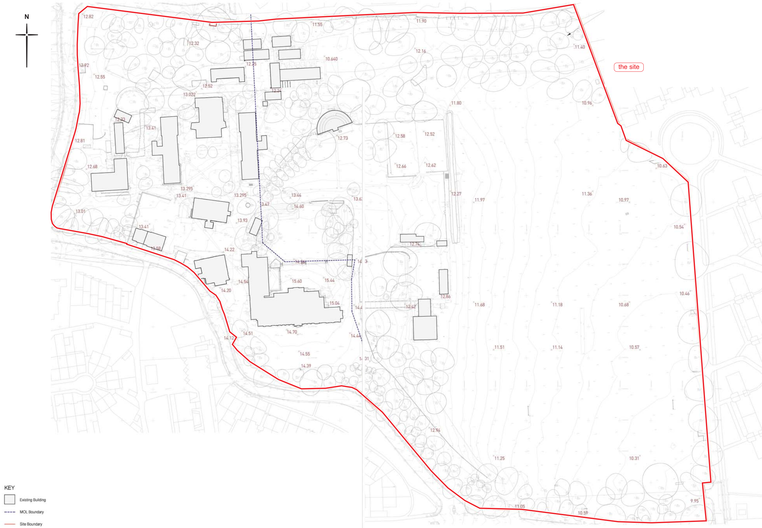
Fig 21 Existing masterplan – Survey (ADP, job no 001506, dwg no ADP-00-00-DR-A-0910 and ADP-00-00-DR-A-0911, rev S2 P2, 21-09-2022)