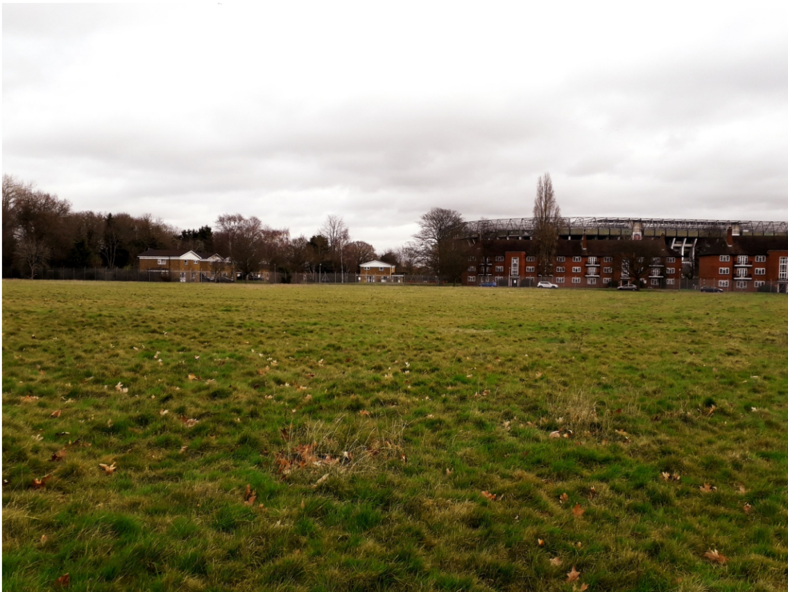
Fig 19 The open land to the east of Kneller Hall, looking east