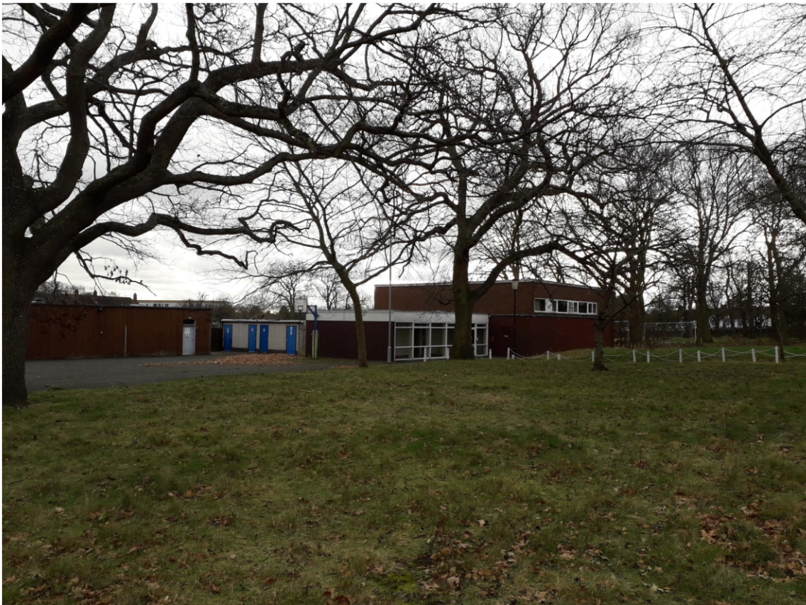
Fig 17 Kneller Hall area, central part of the site, looking south towards the new “Sport Pavilion” (, 03-02-2022)