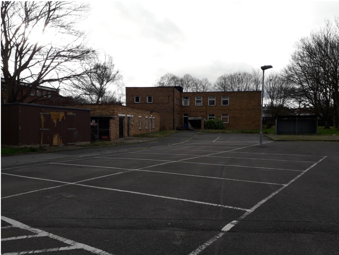
Fig 16 Kneller Hall area, south-western part of site, looking south, towards the new “Teaching Building”