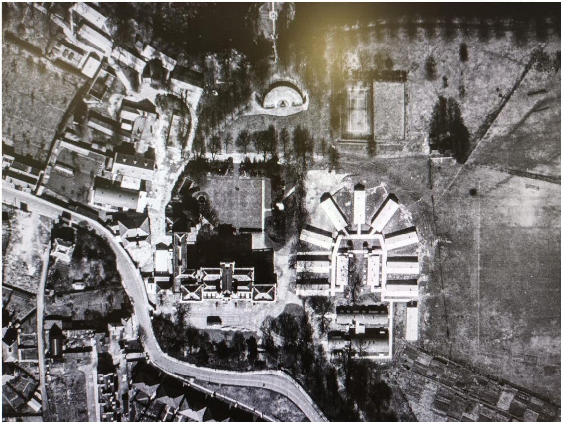
Fig 13 Aerial photograph of the east half of the site taken on 23rd of March 1946 (RAF/106G/UK/1271)