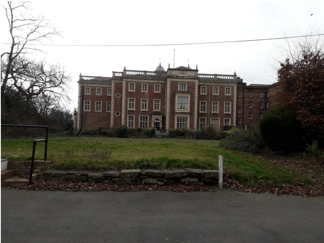
Fig 18 Kneller Hall main building, looking south