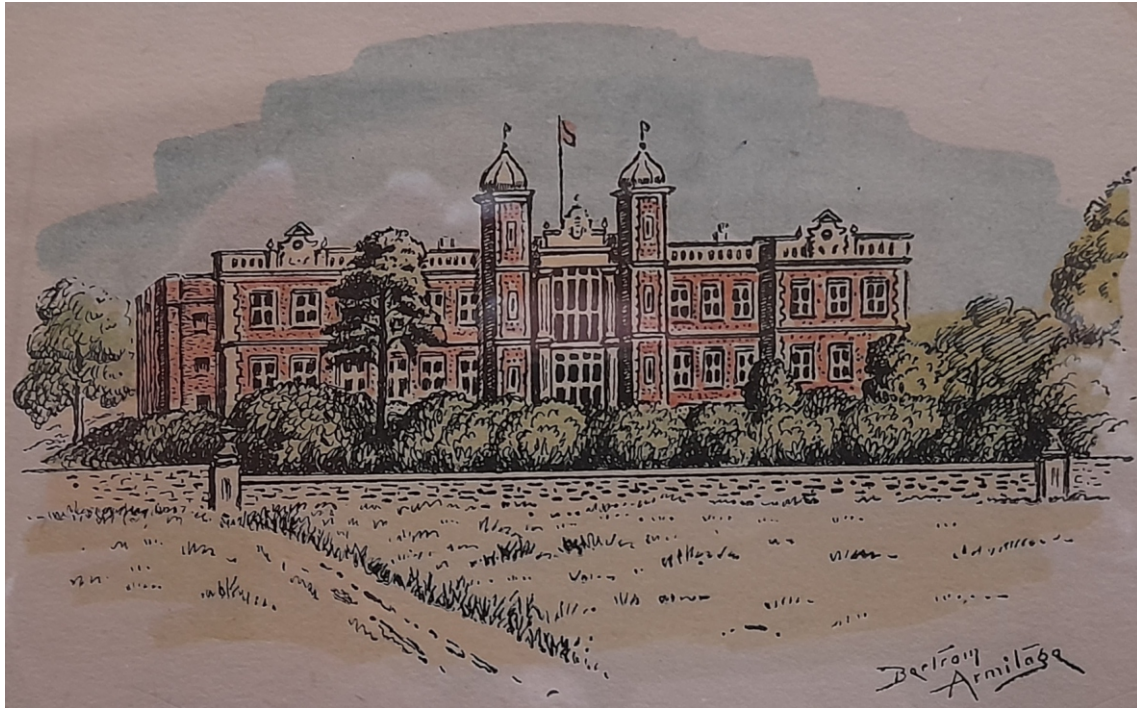
Fig 12 Kneller Hall by Bertram Harmitage