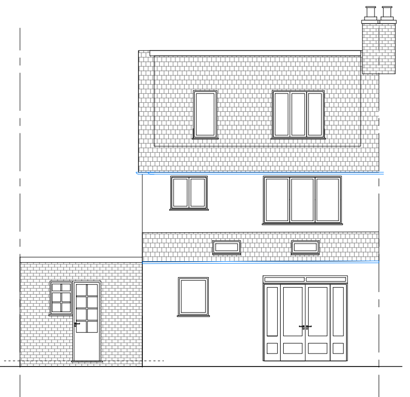
03 Existing Rear Elevation