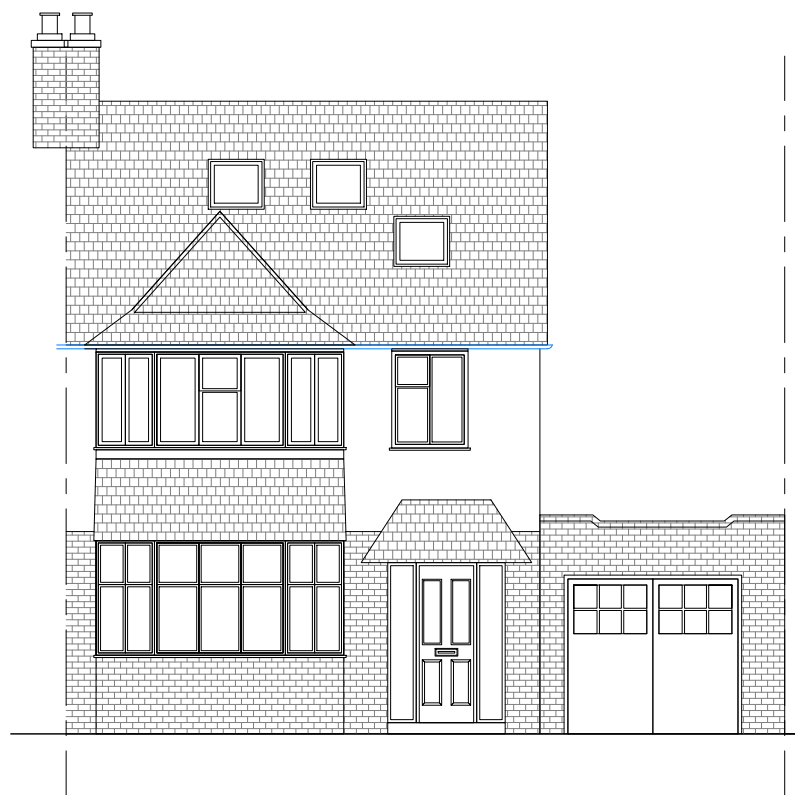
01 Existing Front Elevation