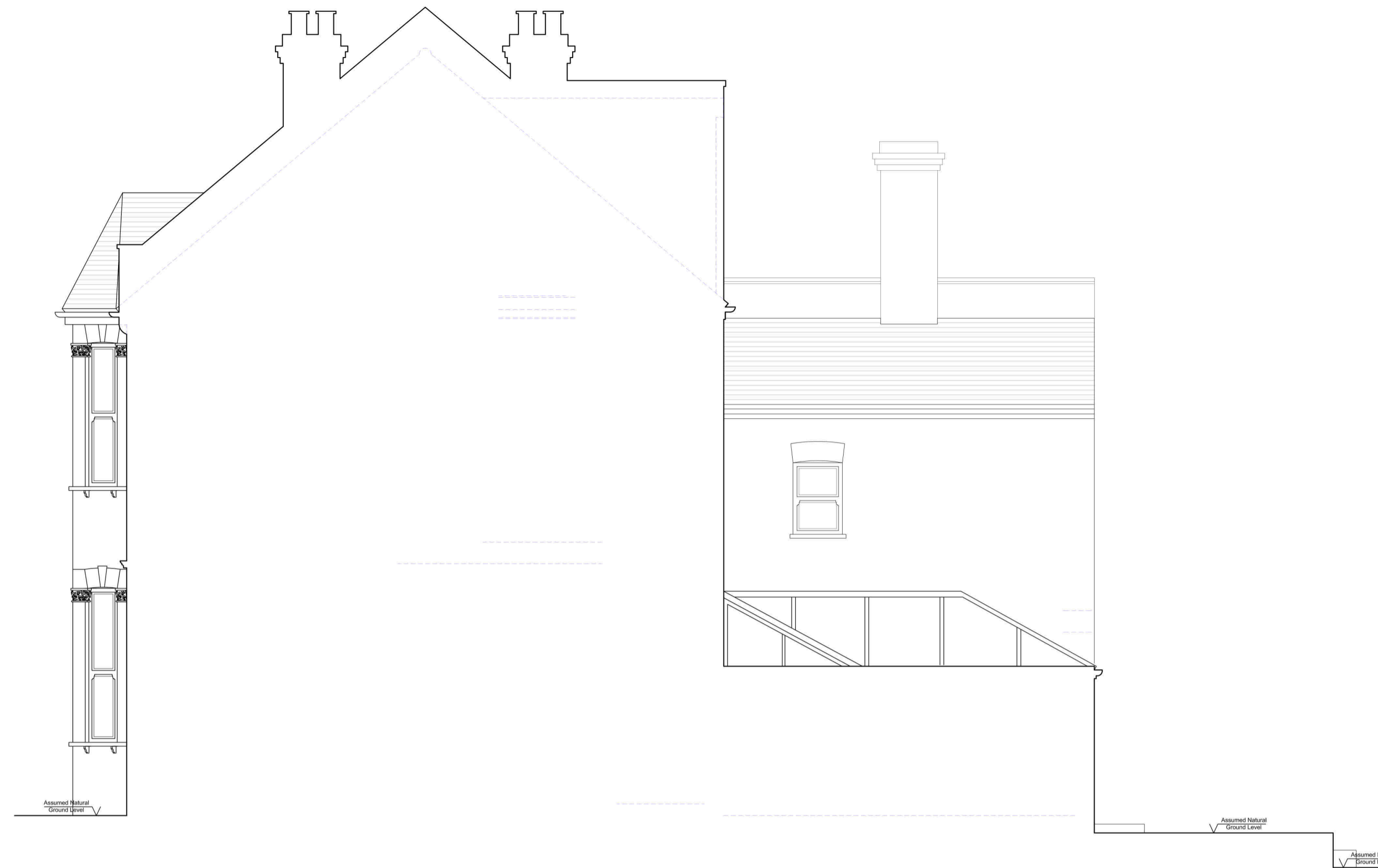
EXISTING SIDE ELEVATION -B-