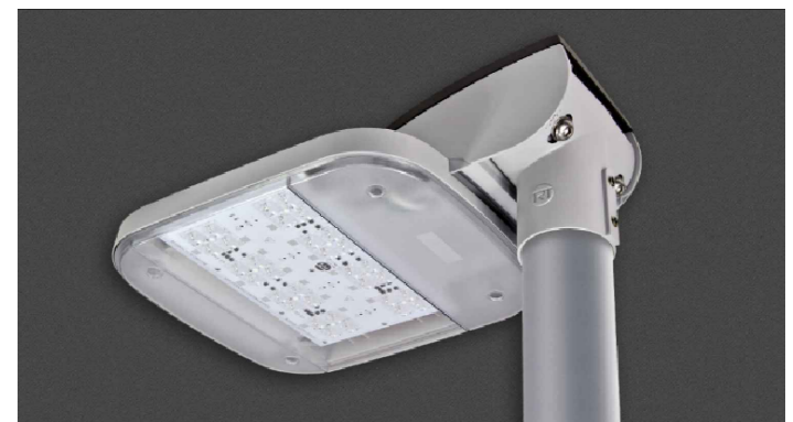
X1 & X2