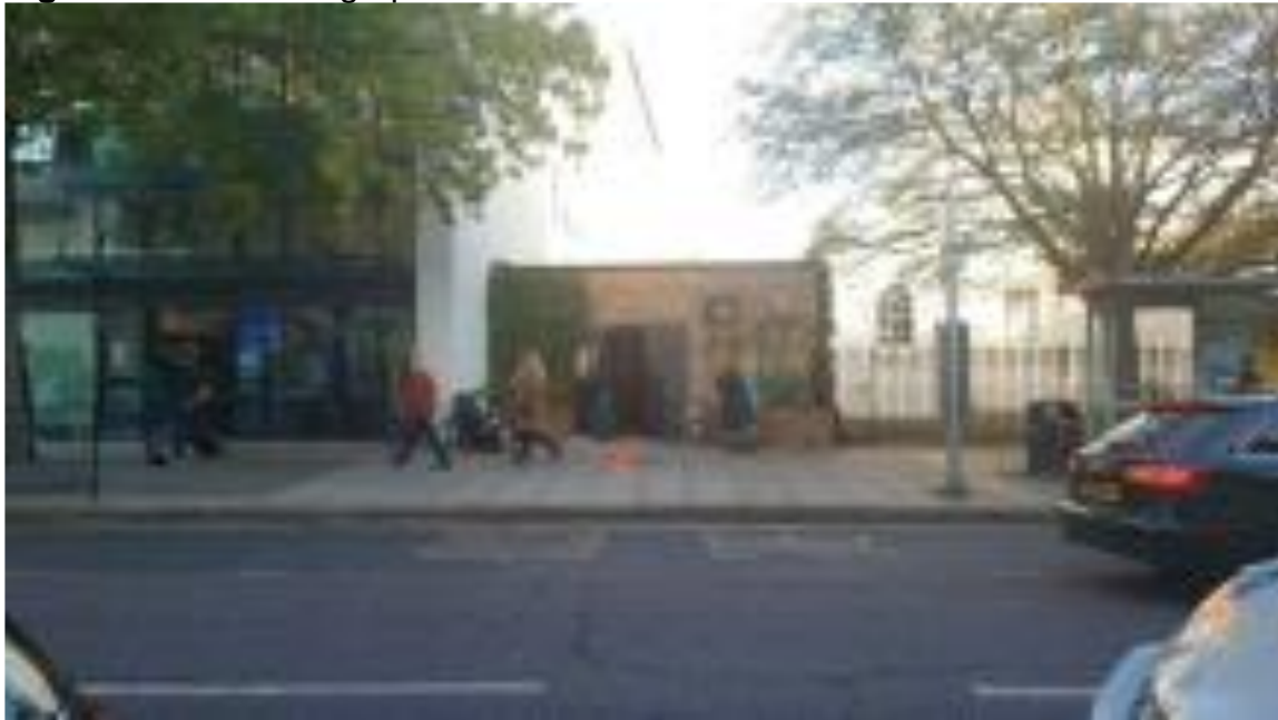
Figure 1 - Site Photograph's

Proposed location of a new mast shown above will assimilate well into the immediate street scene and not be detrimental.