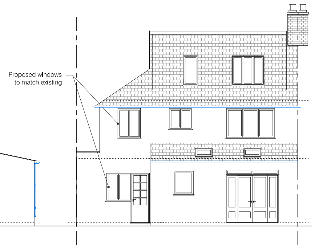
03 Proposed Rear Elevation