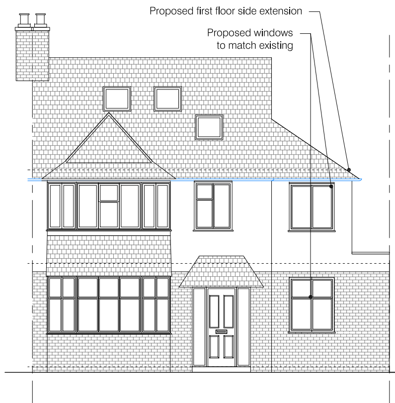
01 Proposed Front Elevation