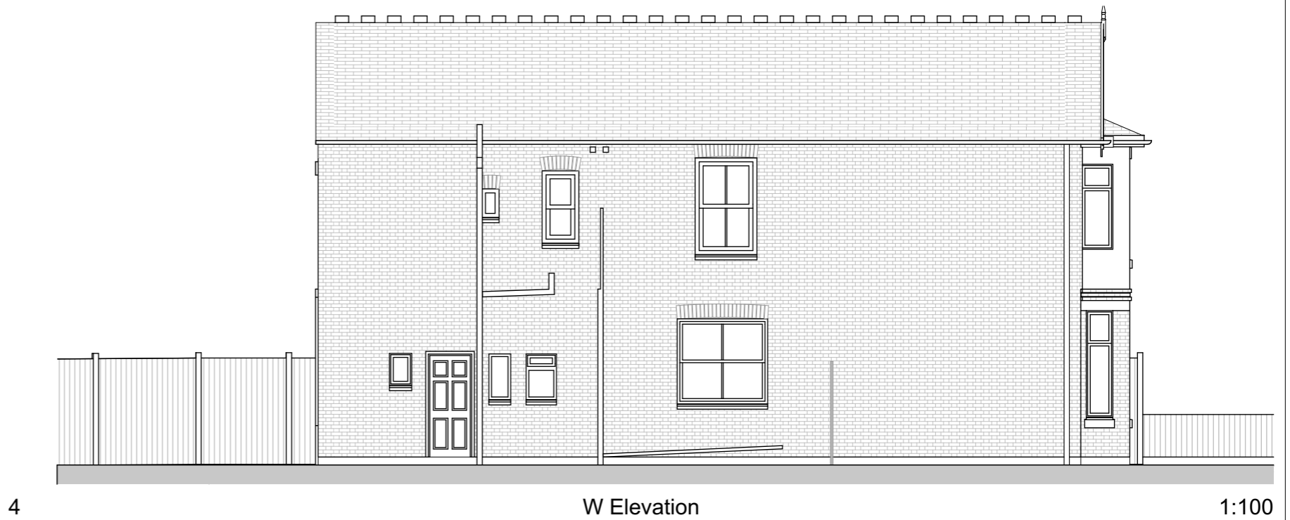
4 W Elevation 1:100