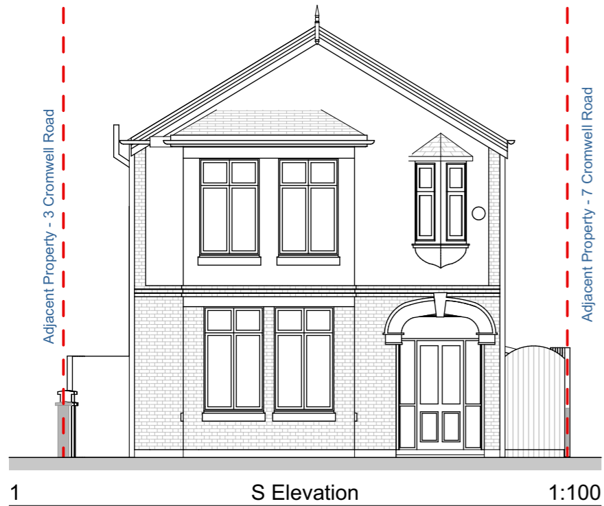
1 S Elevation 1:100