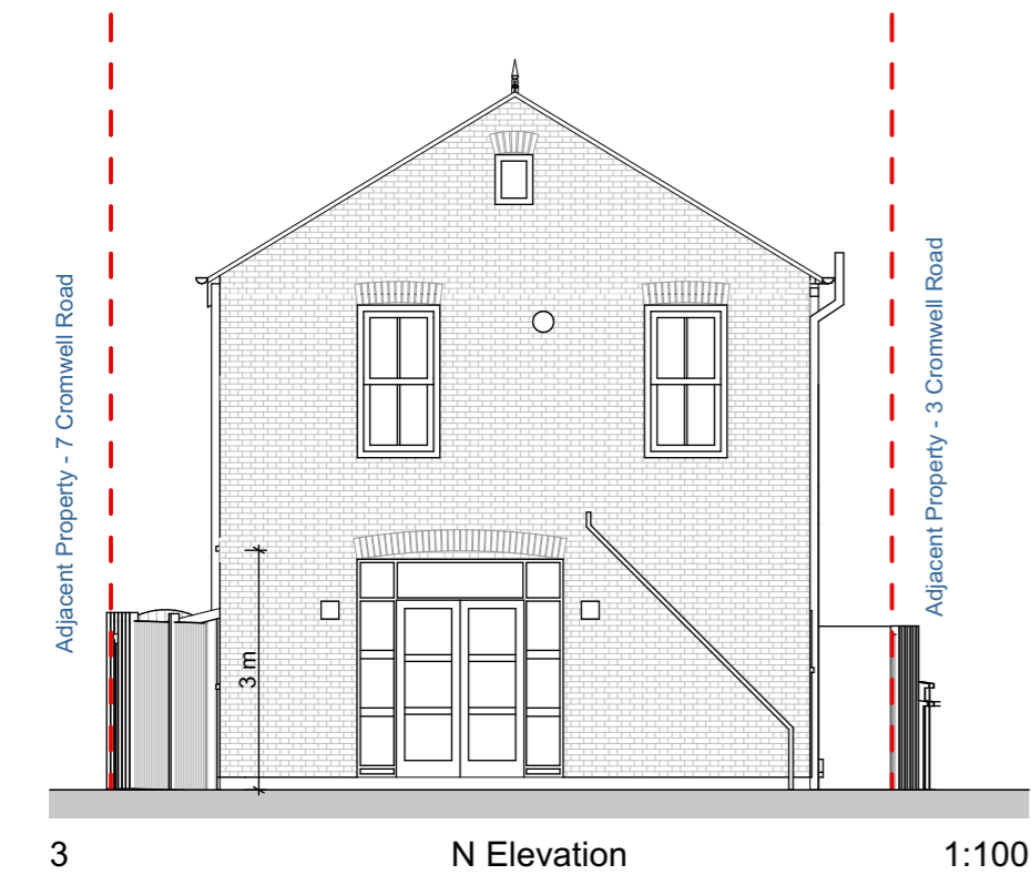
3 N Elevation 1:100