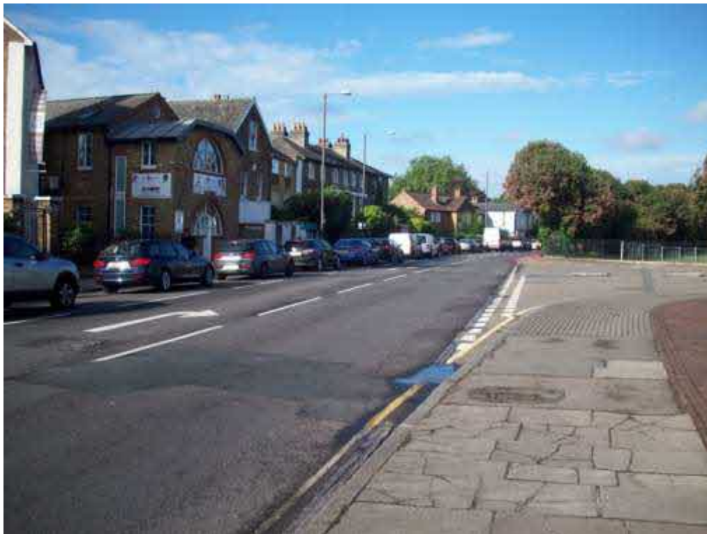
12. Same queue approaching Chalkers Corner outside entrance to Brewery (to become entrance to proposed secondary school)