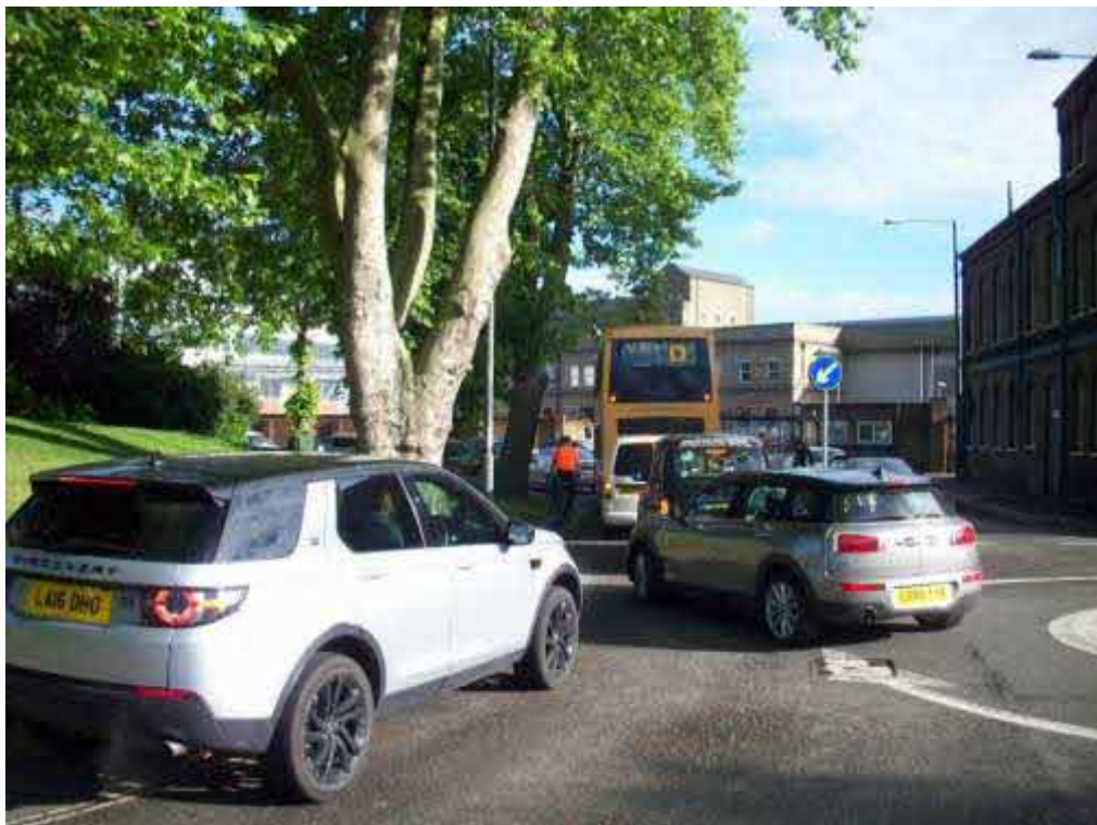
10. Mortlake roundabout with queue into Lower Richmond Road approaching Chalker's Corner