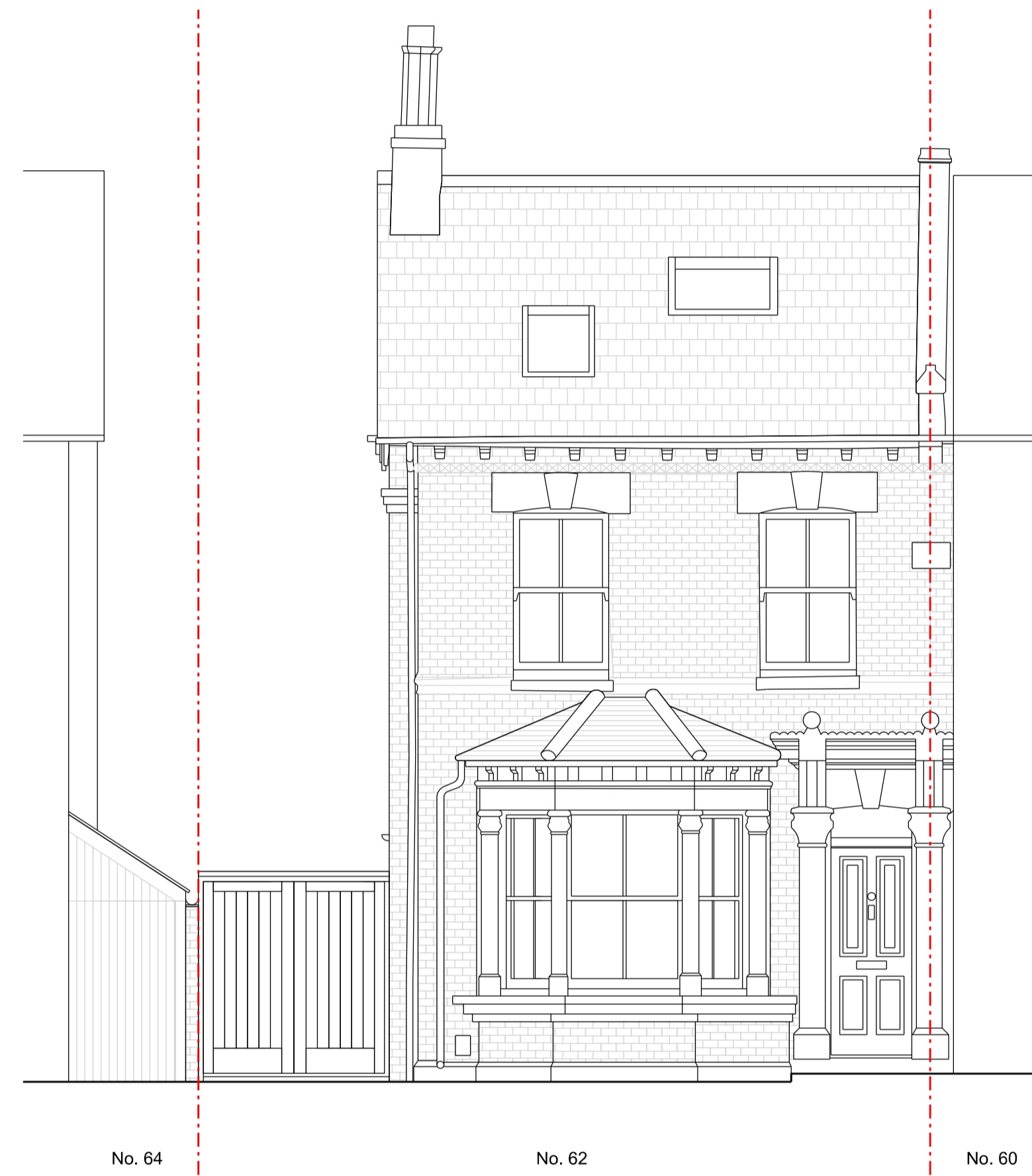
00 Front elevation 1:50