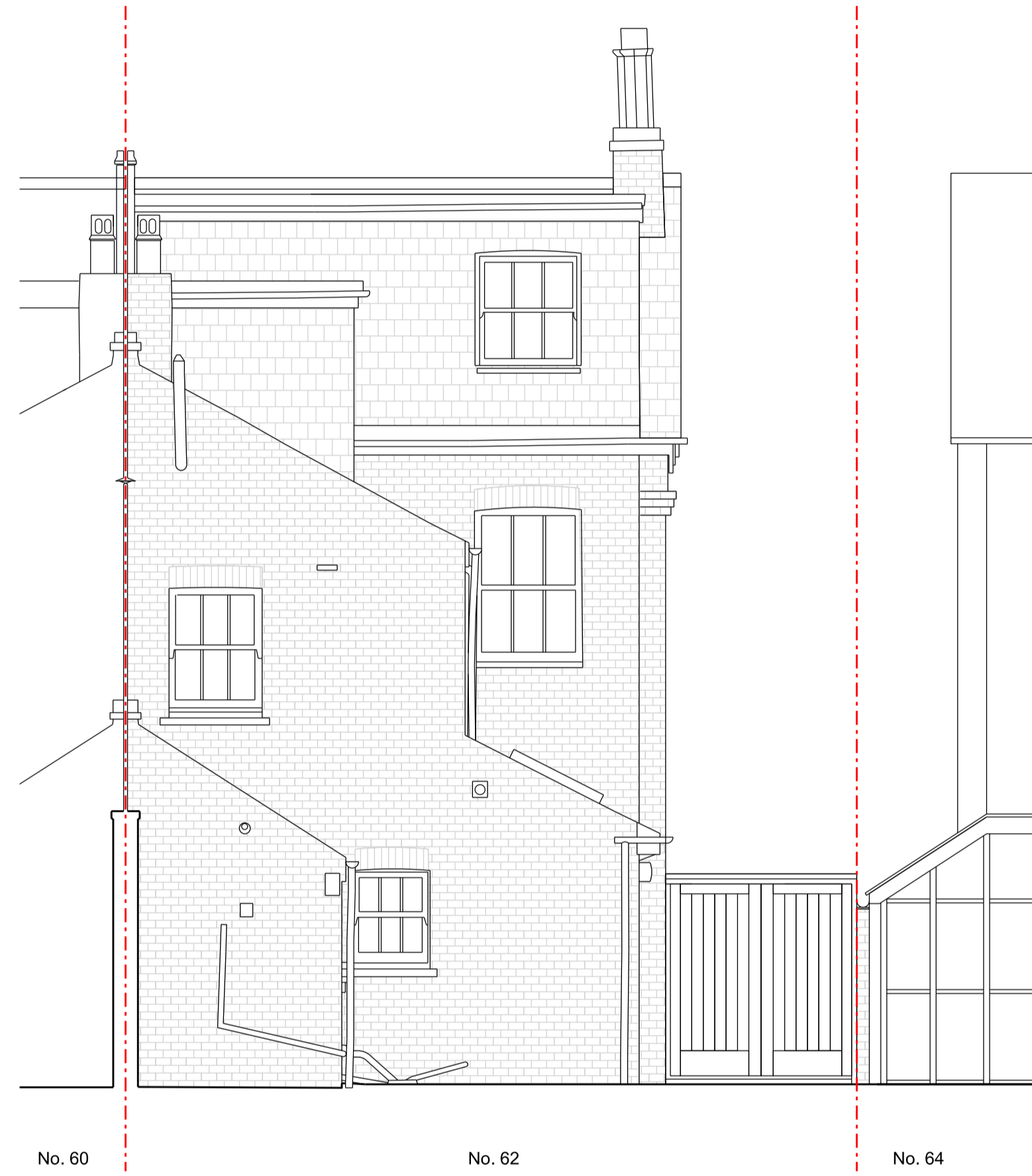
01 Rear elevation 1:50