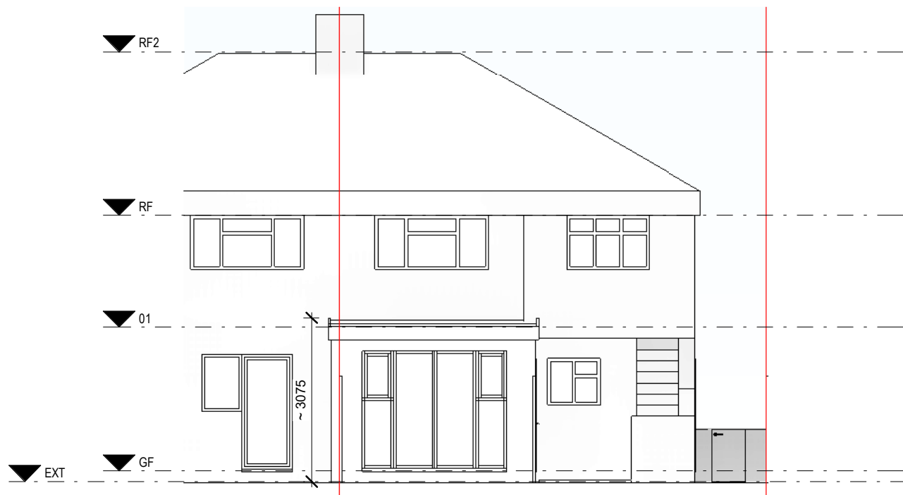
3 Proposed South Elevation 07-0010 1:100