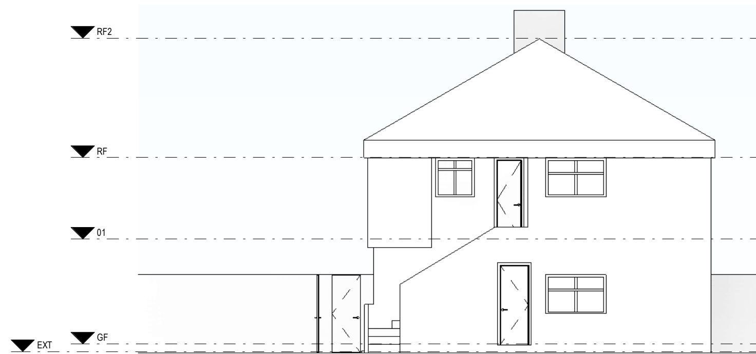
2 Existing East Elevation 1:100