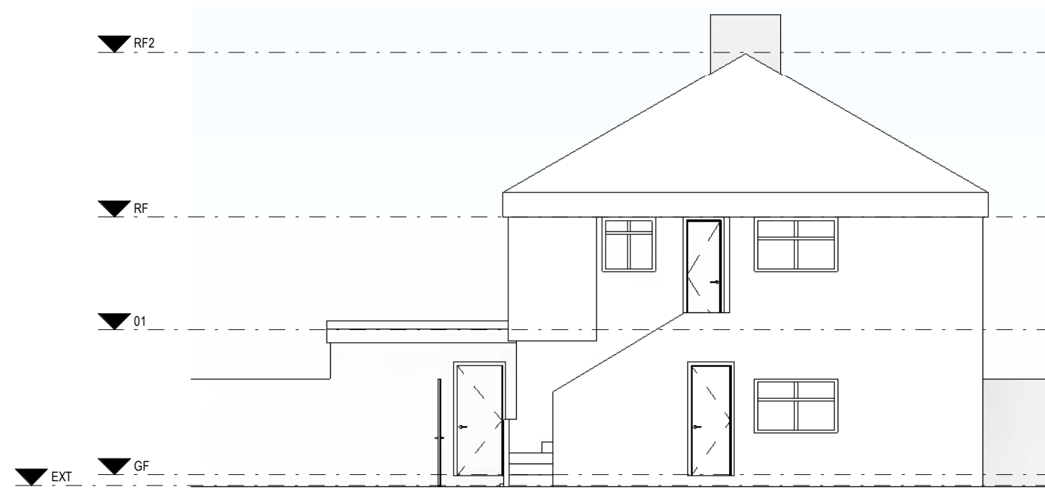
4 Proposed East Elevation 07-0010 1:100