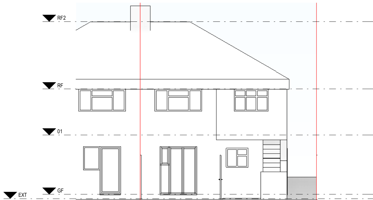
1 Existing South Elevation 1:100