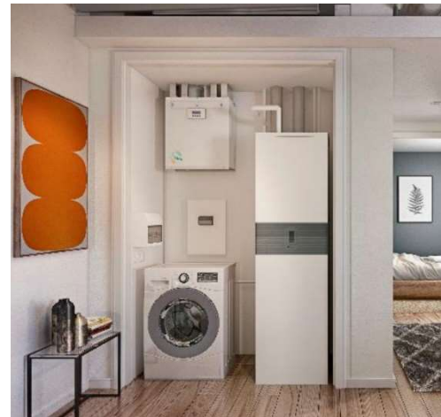
Figure 1 - Apartment block system illustration