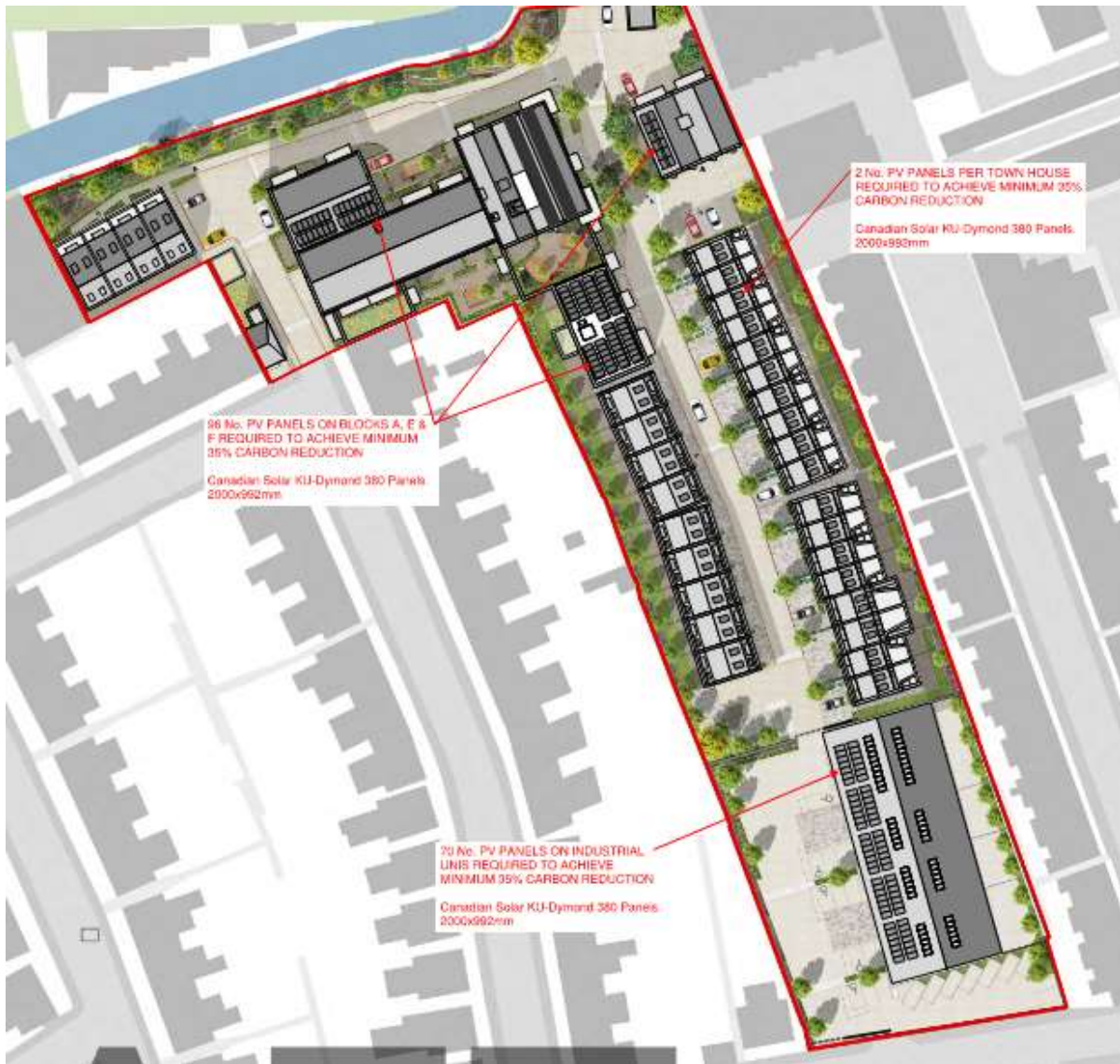
Figure 3 – Photovoltaic cells across the site

As detailed in the site wide Energy Strategy report, it is proposed Photovoltaic cells will be installed to the roof of each townhouse and the industrial building identified on the site plan below. The provision of photovoltaic cells shown is to ensure the site wide carbon emissions improvement is maximised and the carbon offset payment is limited, whilst ensuring the GLA target is met.