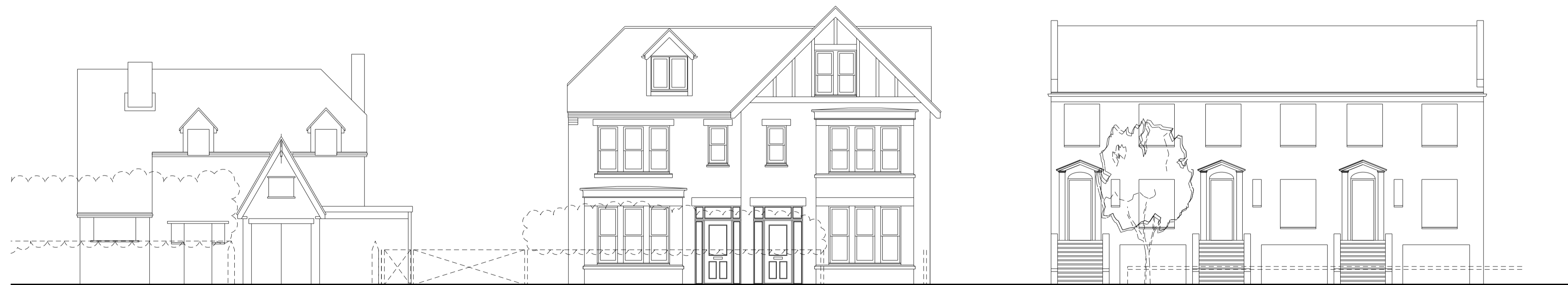
03 Proposed Street View SCALE 1:100