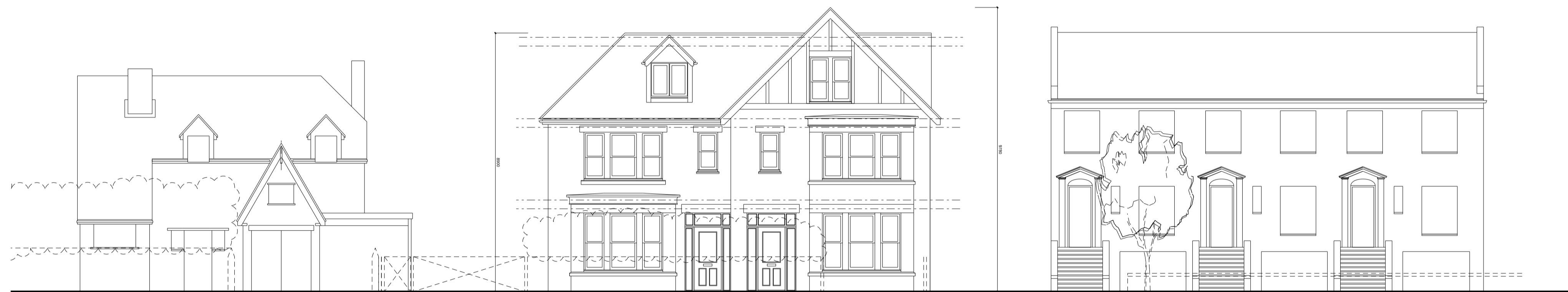
02 Approved Street View SCALE 1:100