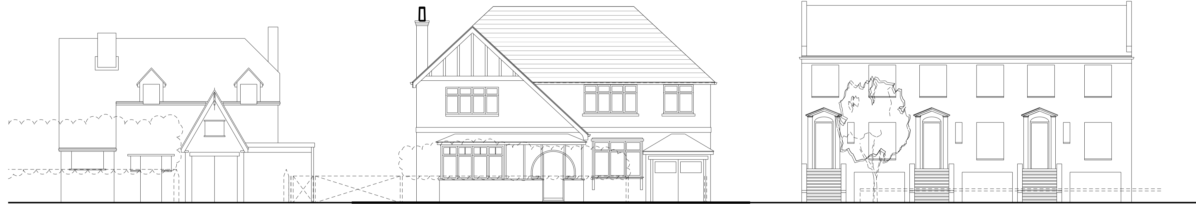
01 Existing Street View SCALE 1:100