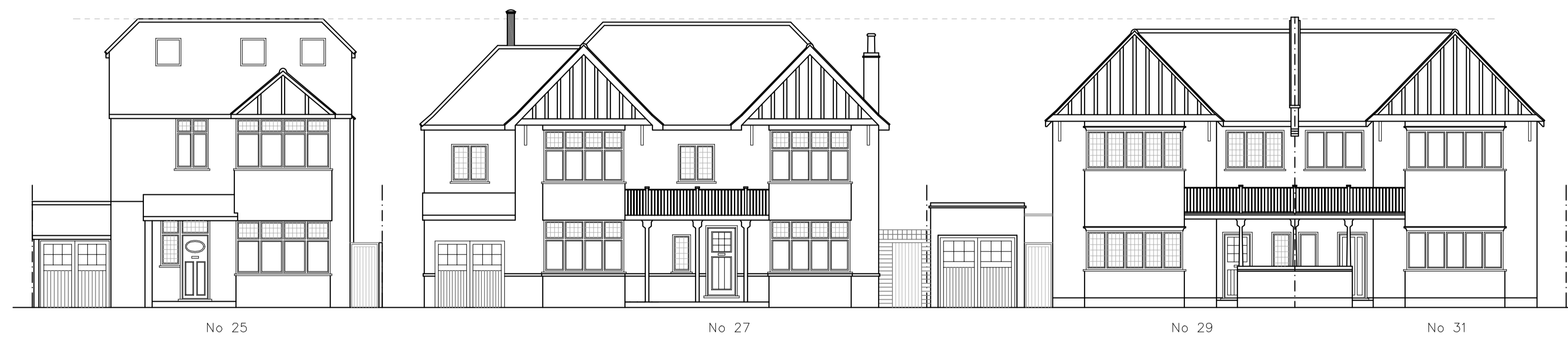
PROPOSED FRONT ELEVATION – STREET SCENE 1:100