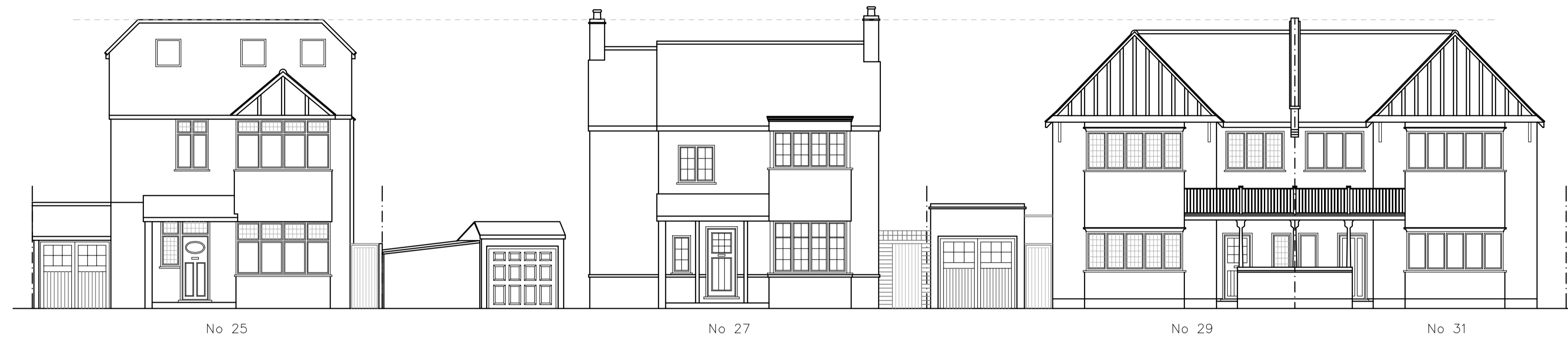
EXISTING FRONT ELEVATION – STREET SCENE 1:100