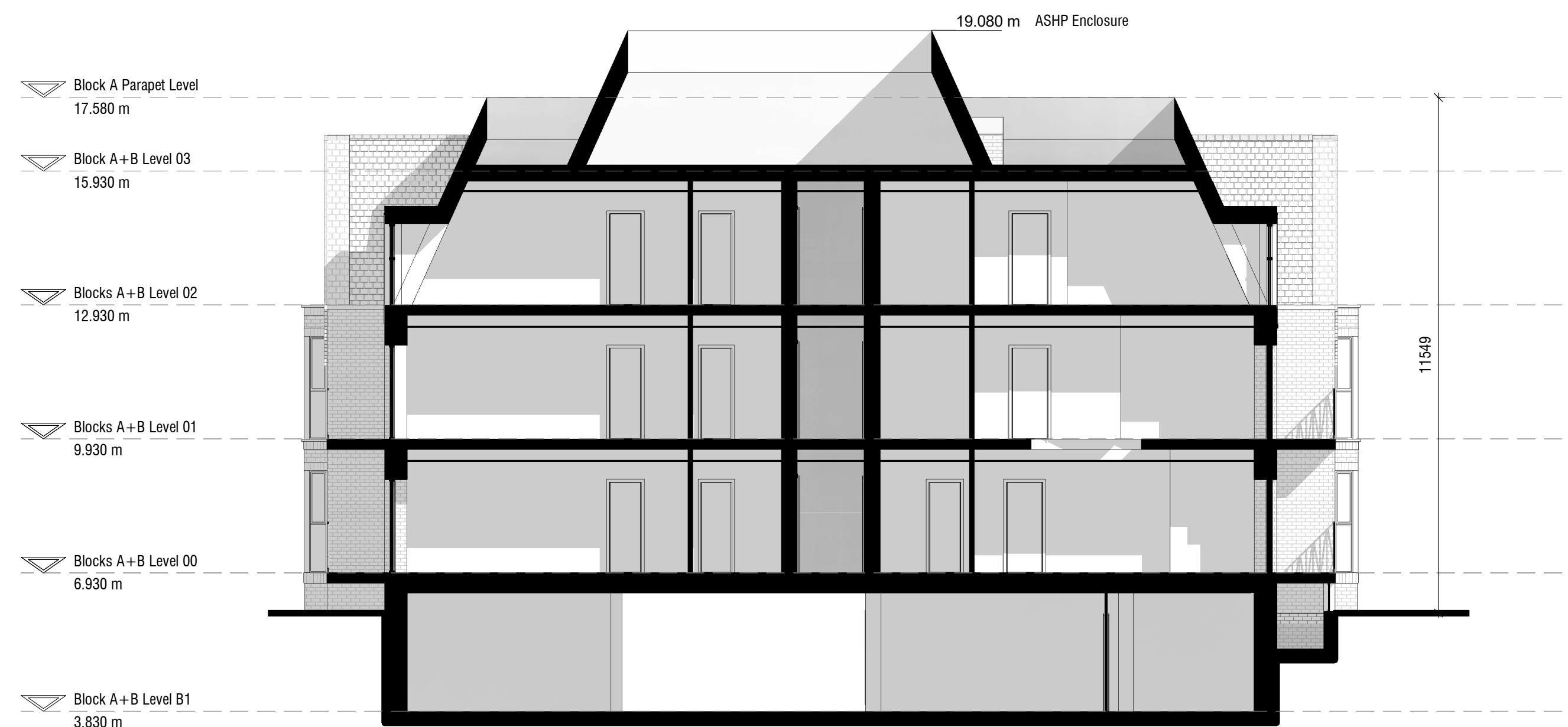
1 Block A - Section 1 1 : 100