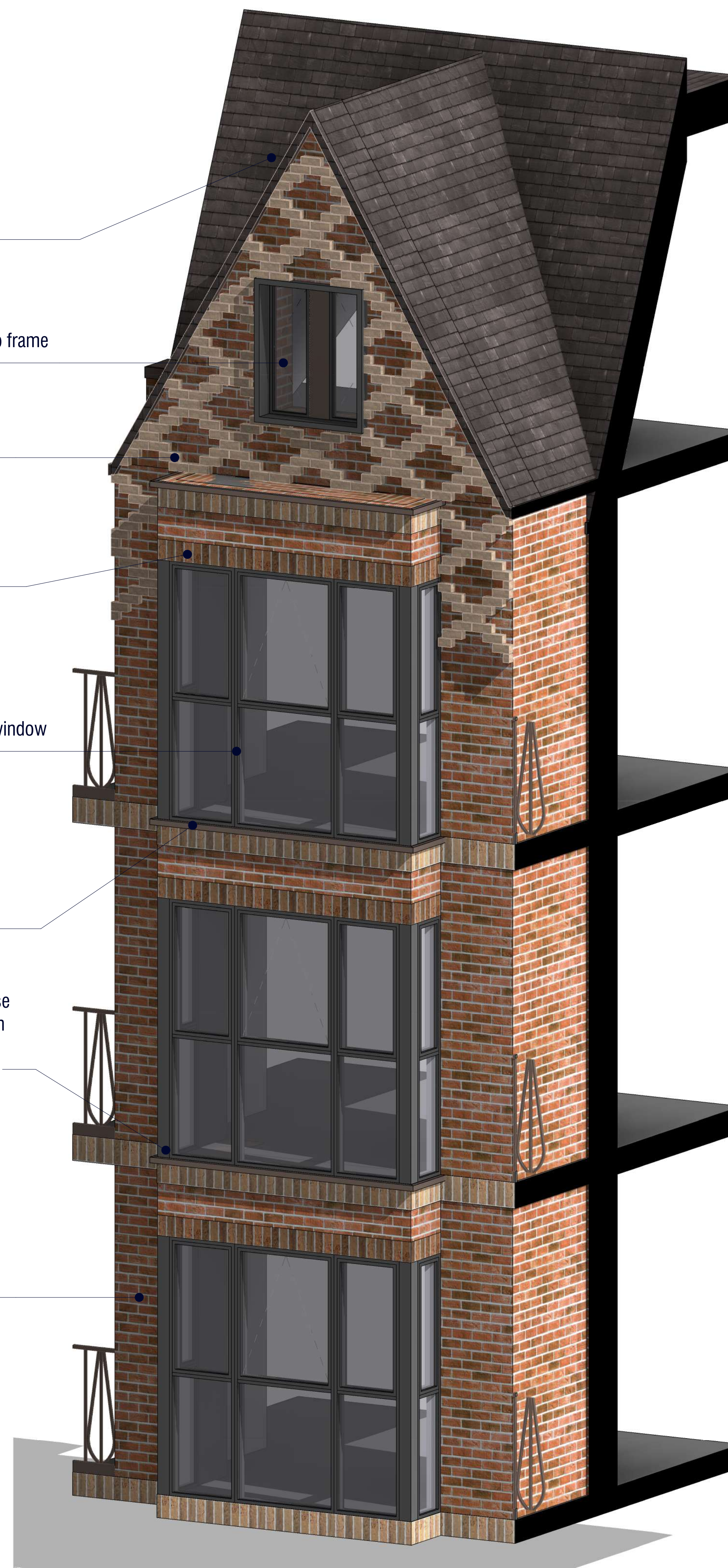
4 Typical Gable 3D