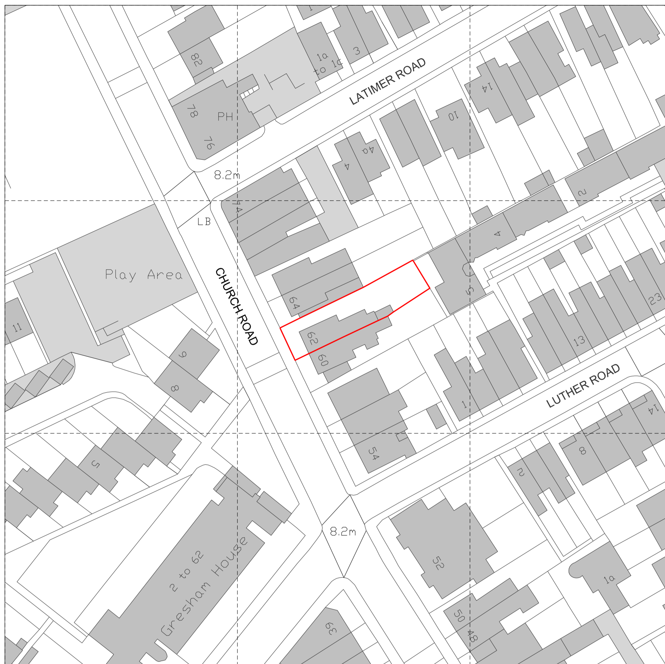
00 Location Plan