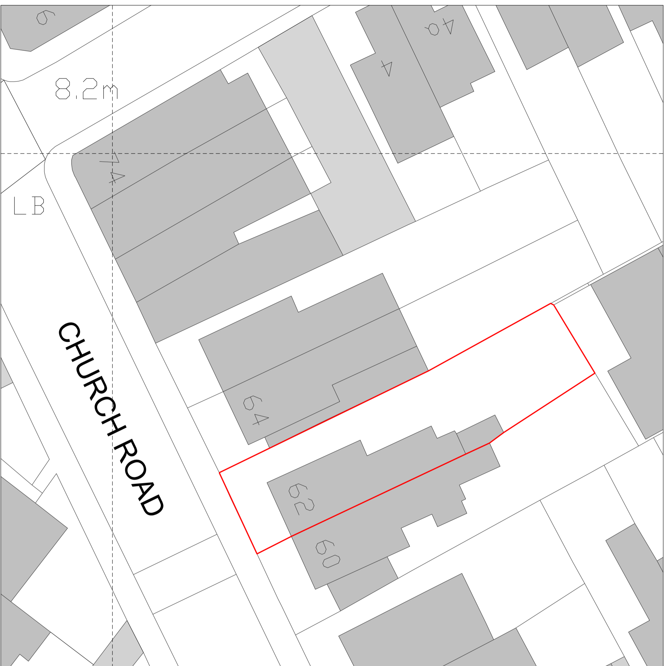
01 Existing Site Block Plan