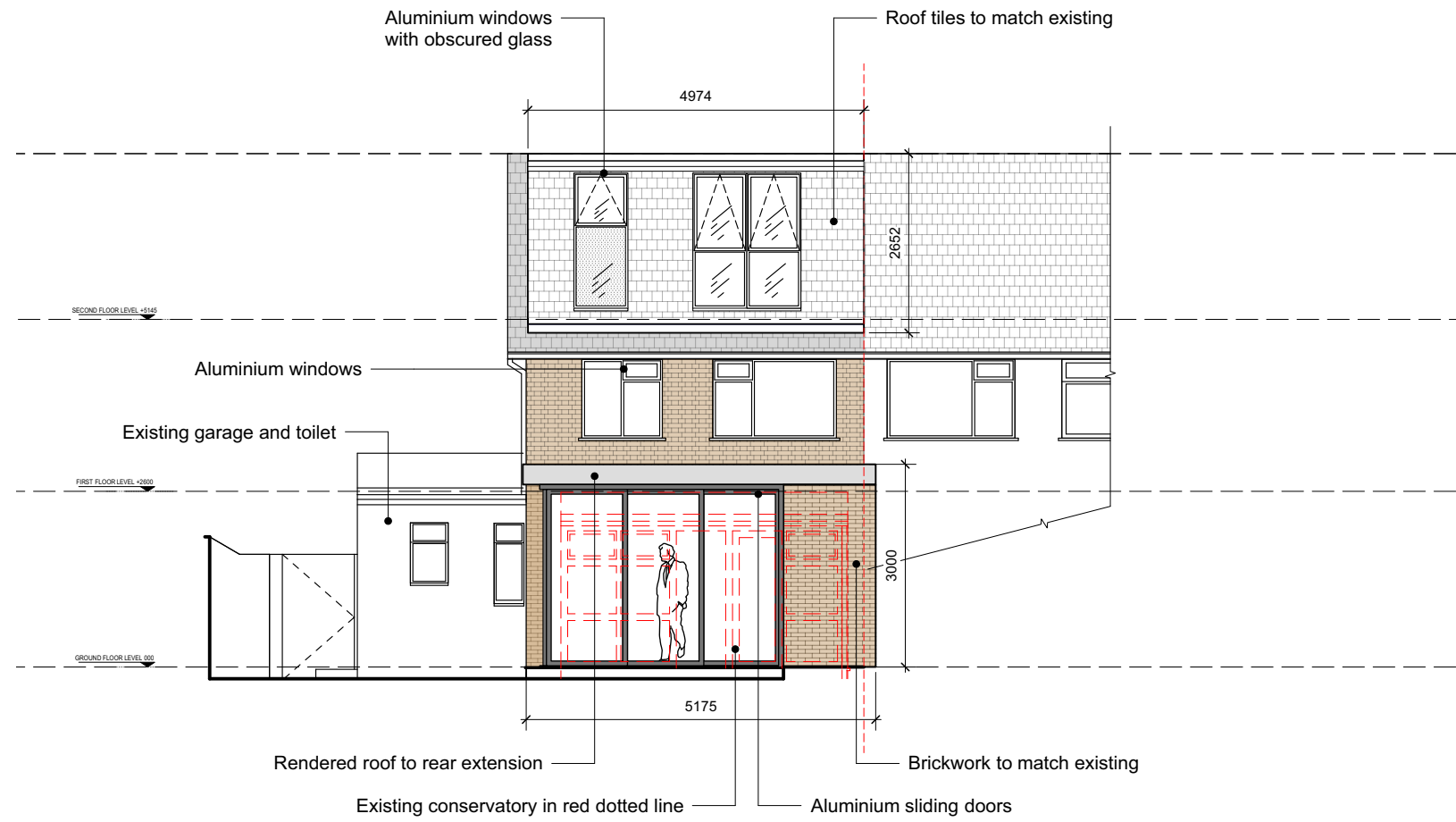
01 Proposed Rear Elevation 1:100 @ A3

Loft extension volume calculation: \frac{4.974 \times 2.652 \times 3.851}{2} = 25.39 \text{ m}^3