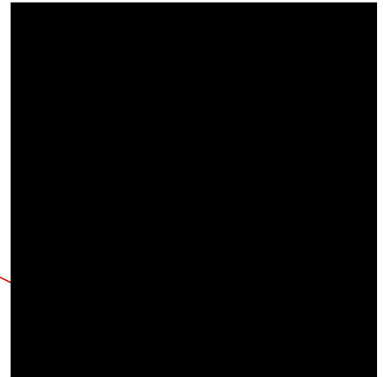
Rear View of 50 Church Road