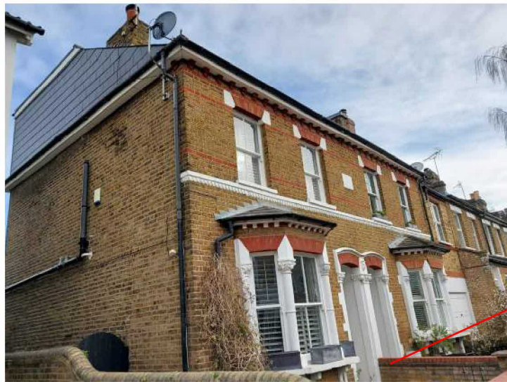
Front View of 50 Church Road