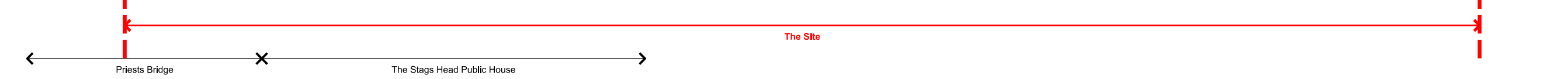
01 - Proposed South East Elevation 1:200@A3