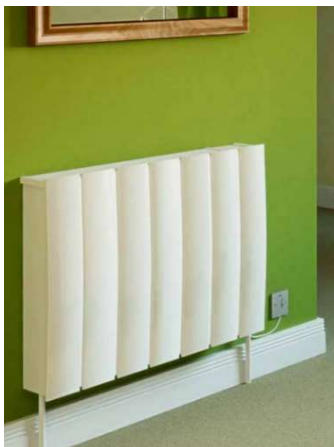
Fan assisted radiator

The outdoor condenser unit shall be installed within an acoustic enclosure, on a raised flat concrete base, to allow condense water to drain away.