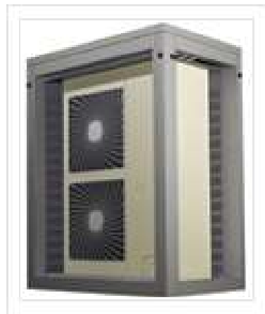
Condenser in an acoustic enclosure