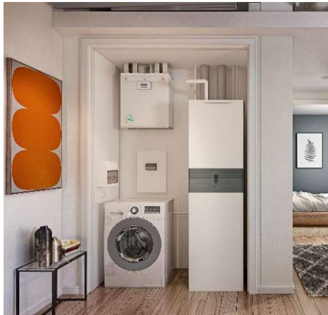
Figure 2 – A heat pump and hot water cylinder within an apartment utility cupboard

The heating system within each apartment will be ostensibly the same as a conventional system. The only obvious difference will be the way in which heat energy is delivered into the apartment. In a conventional system a gas fired boiler generates the heat that is delivered to the radiators and taps through low temperature hot water (LTHW) and domestic hot water (DHW) respectively. Metered gas is piped to the apartment. In the proposed system the boiler is replaced with an electric reverse cycle heat pump, which takes the heat out of the condenser water loop, which is maintained between 15°C and 25°C by the central plant, and further increases the temperature of the water up to 60°C and delivers it to the radiators and taps, via the hot water cylinder. No gas supply is required. Within each apartment the heat pump and hot water cylinder are installed within an internal cupboard.