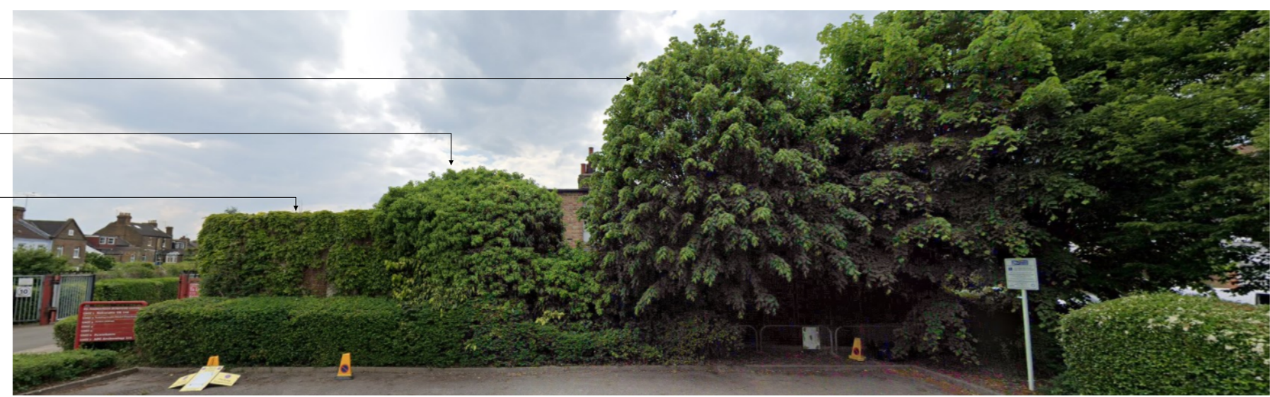
XX 0302 Existing Boundary Wall Condition With 2 Godstone Road

P1 2023-03-29 Issued For Planning Revision Date Description