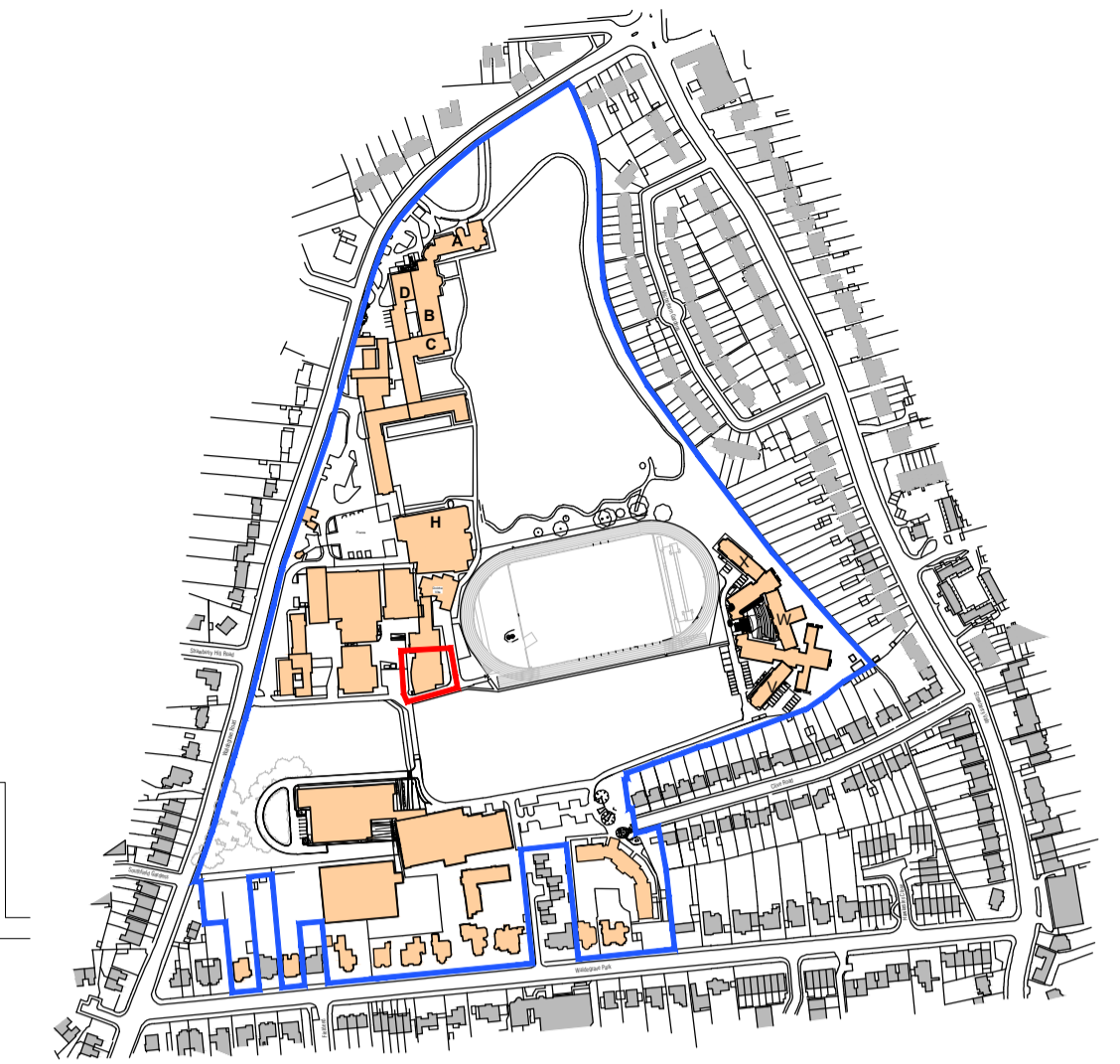
1:5000 Scale Location Plan.