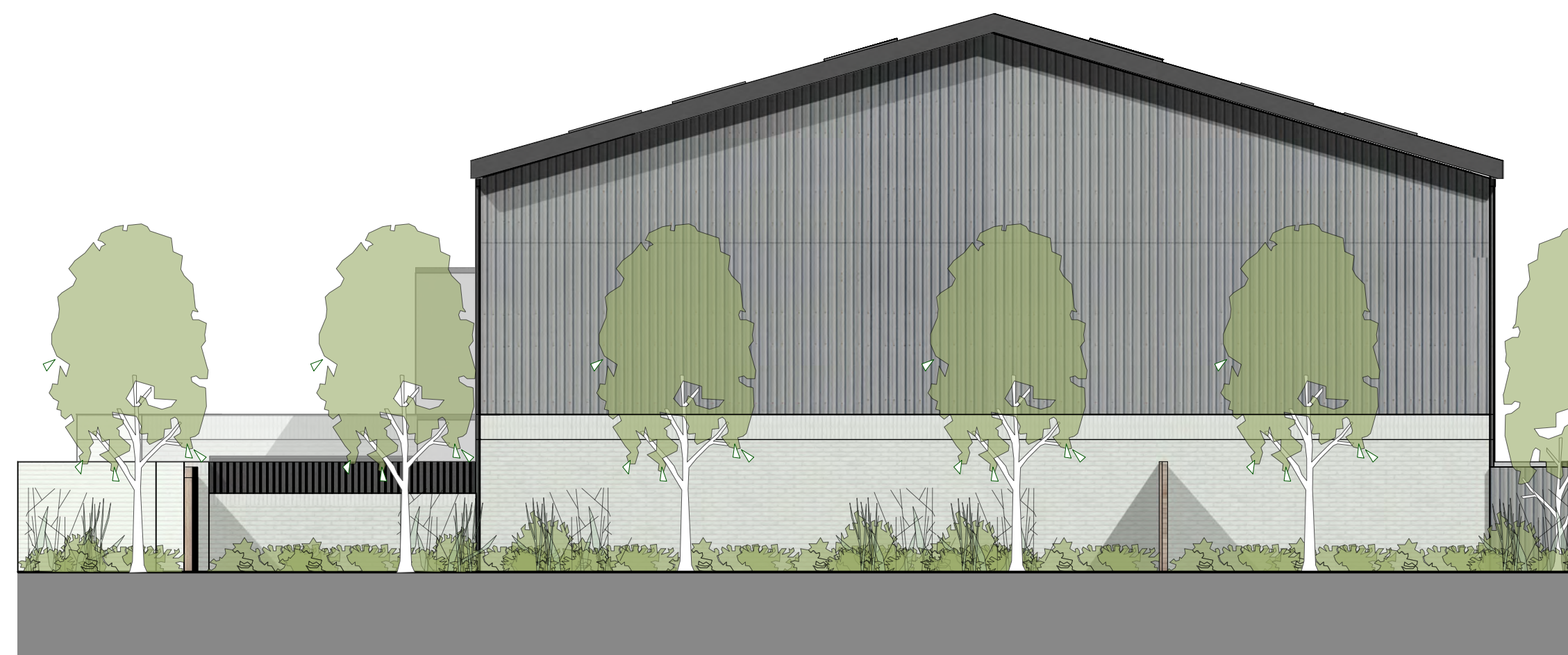
3 Elevation C Scale: 1:100