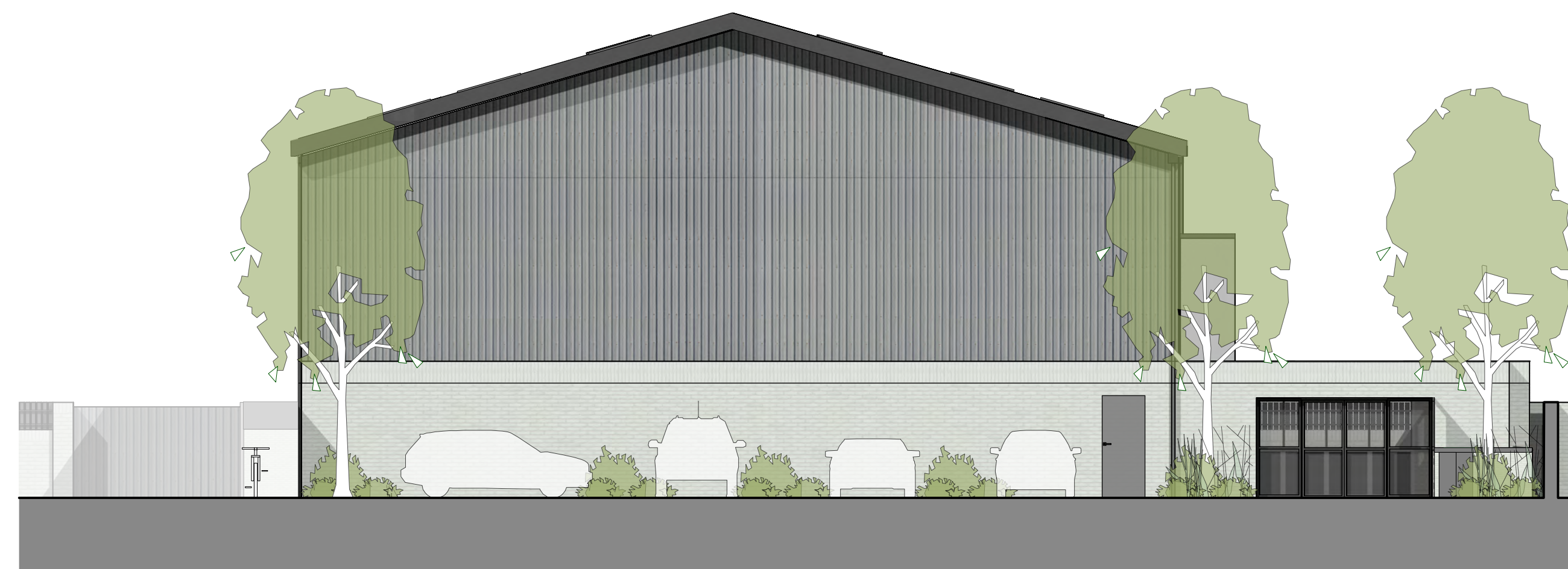
4 Elevation D Scale: 1:100