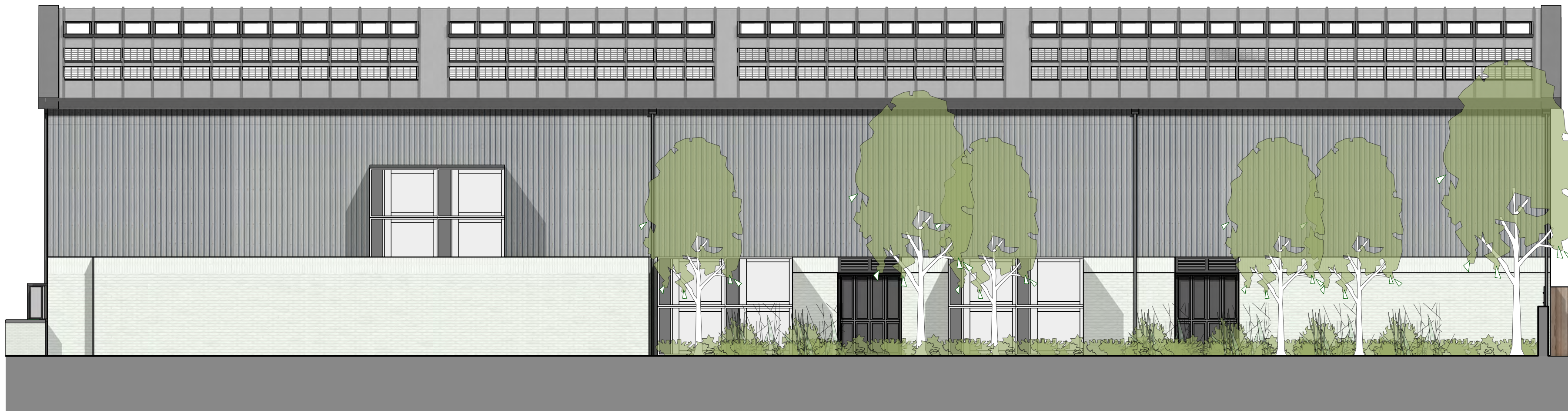
2 Elevation B Scale: 1:100