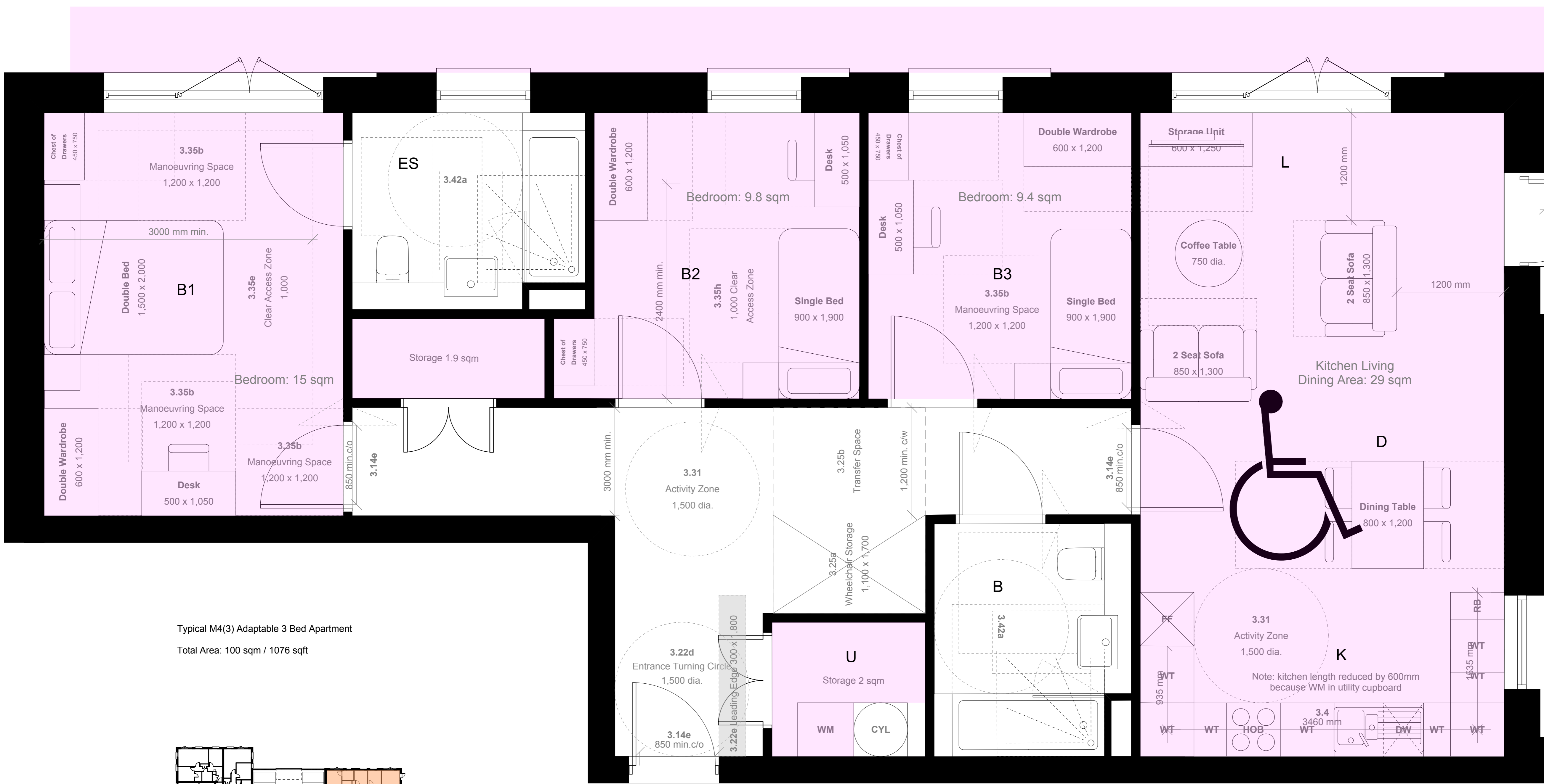
Typical M4(3) Adaptable 3 Bed Apartment Total Area: 100 sqm / 1076 sqft