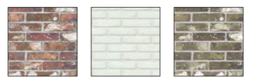
Other brick tones for this house type