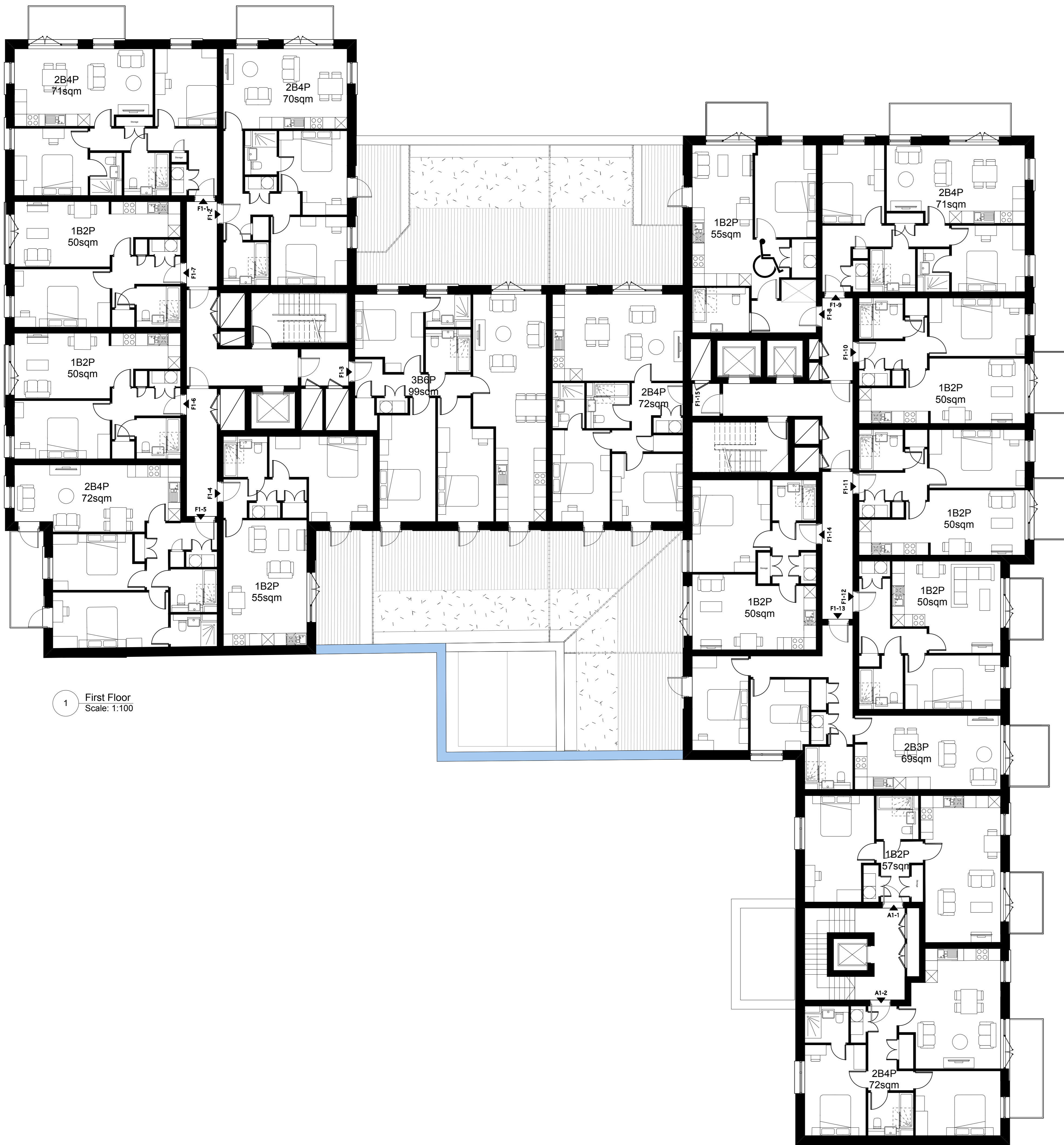
1 First Floor Scale: 1:100