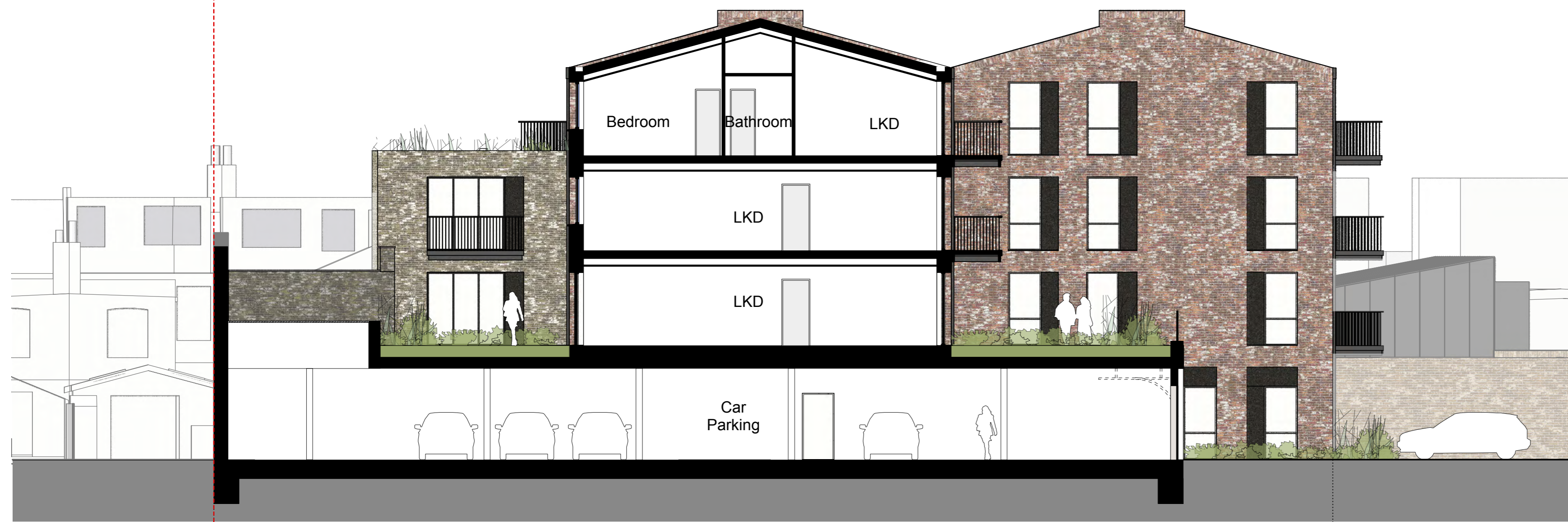
1 Section A Scale: 1:100