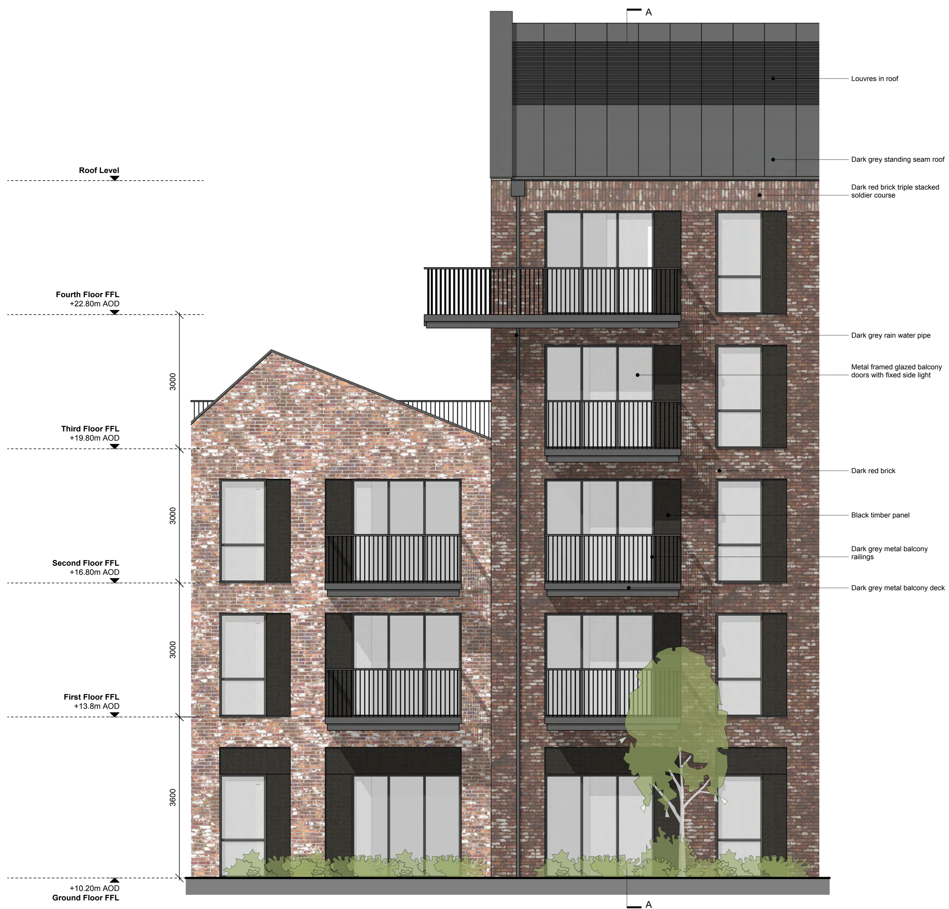
EAST ELEVATION EXTRACT