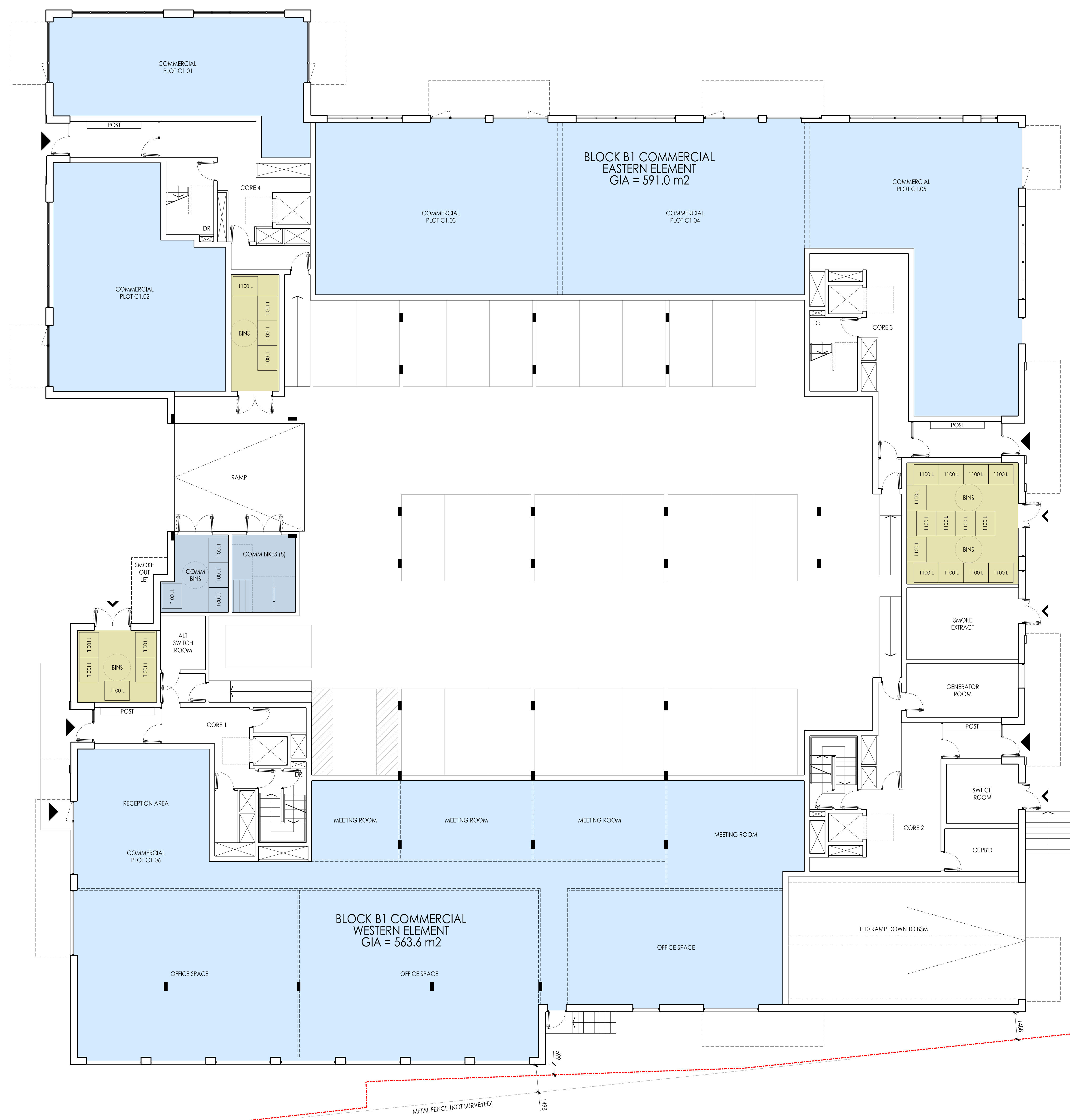
BLOCK B1: GROUND FLOOR PLAN