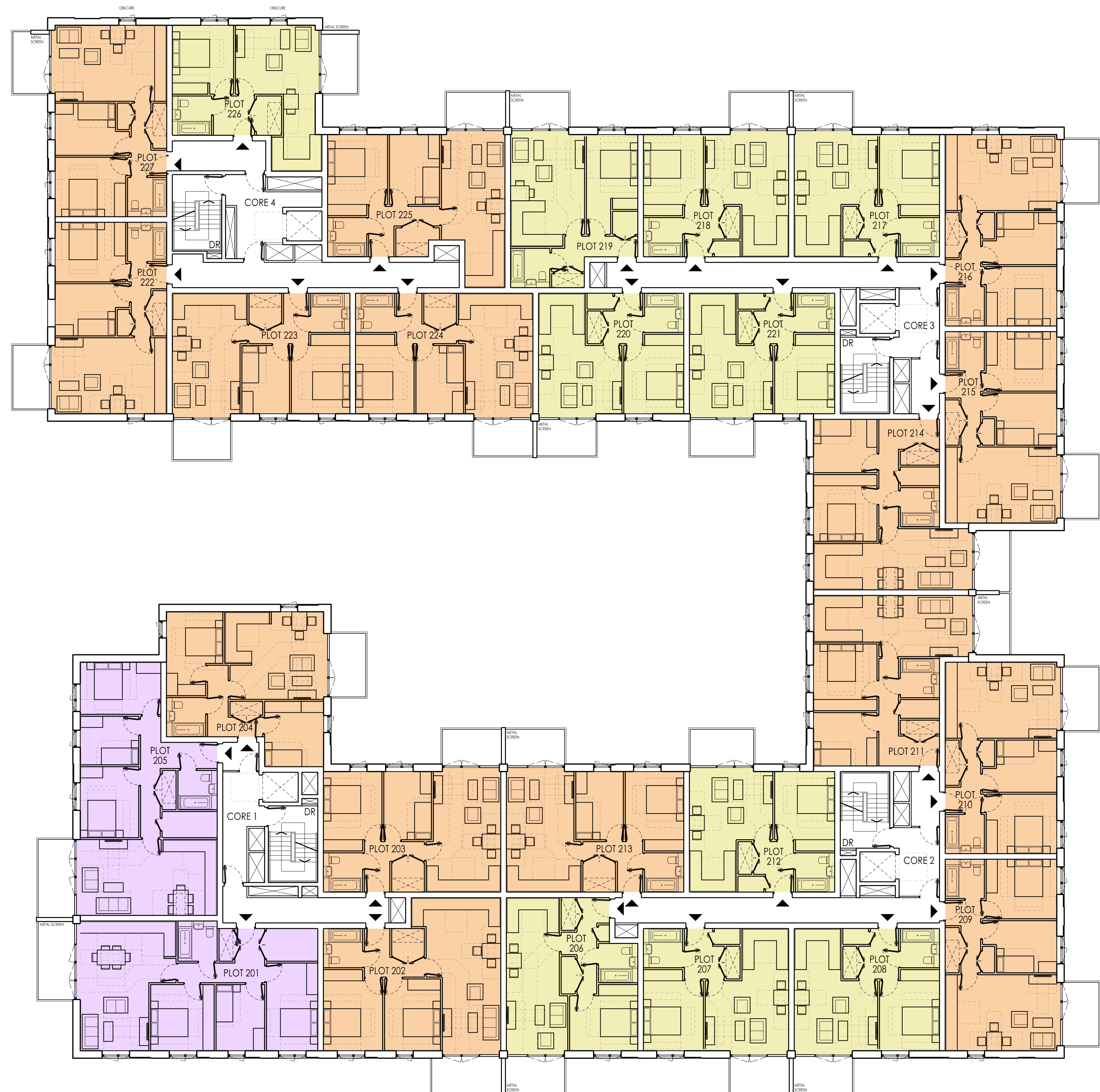
BLOCK B1: SECOND FLOOR PLAN