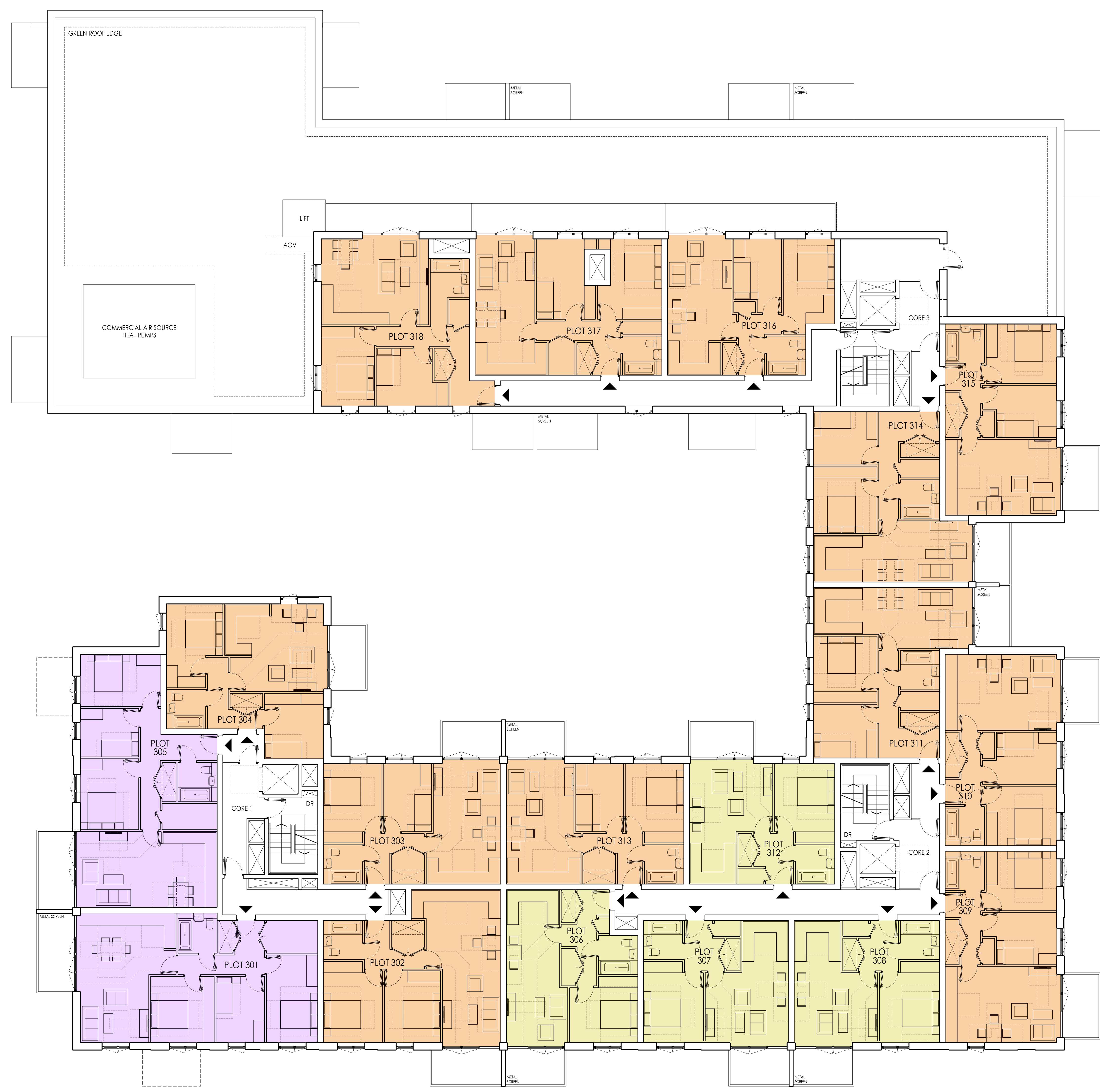
BLOCK B1: THIRD FLOOR PLAN