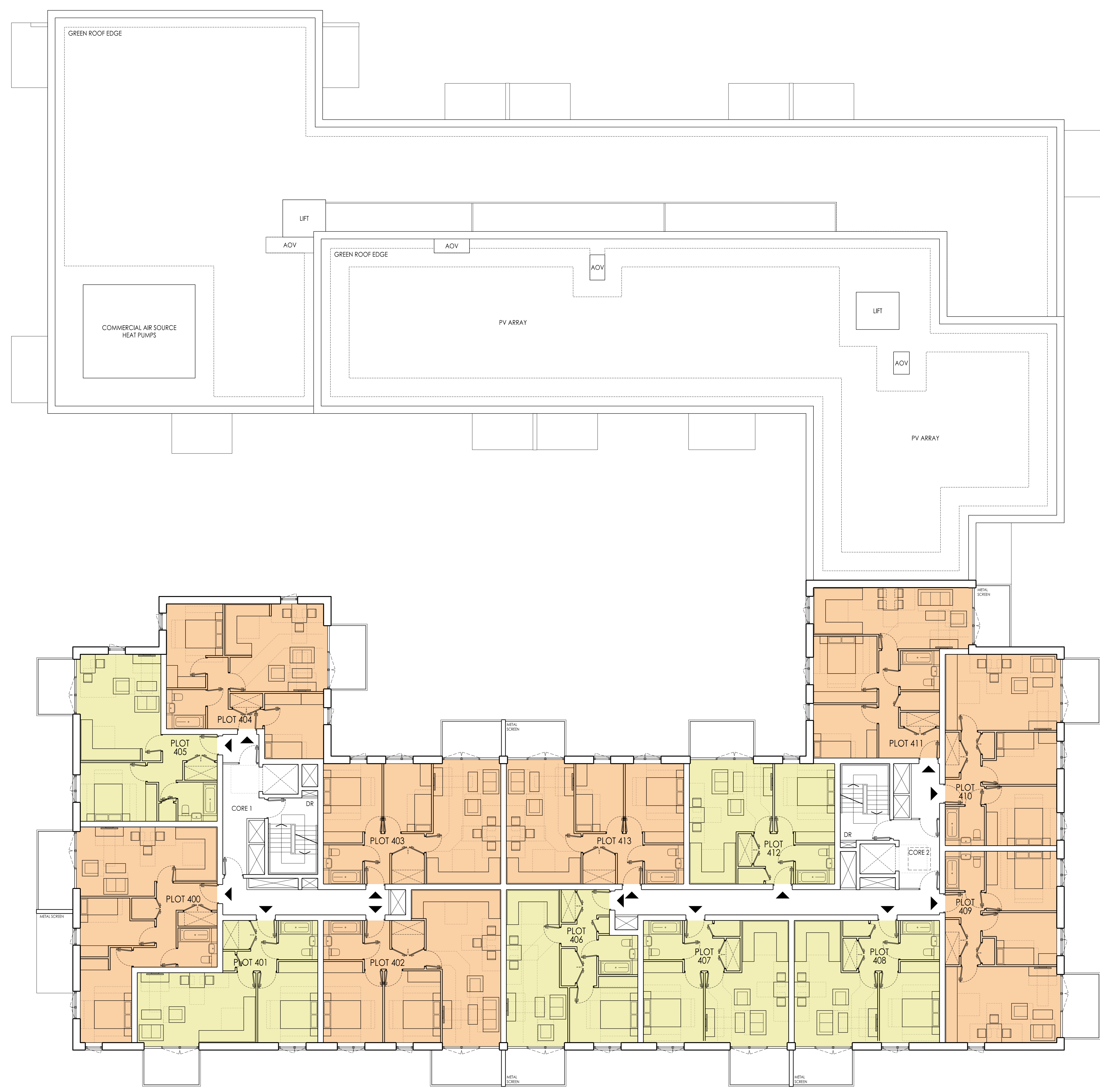
BLOCK B1: FOURTH FLOOR PLAN