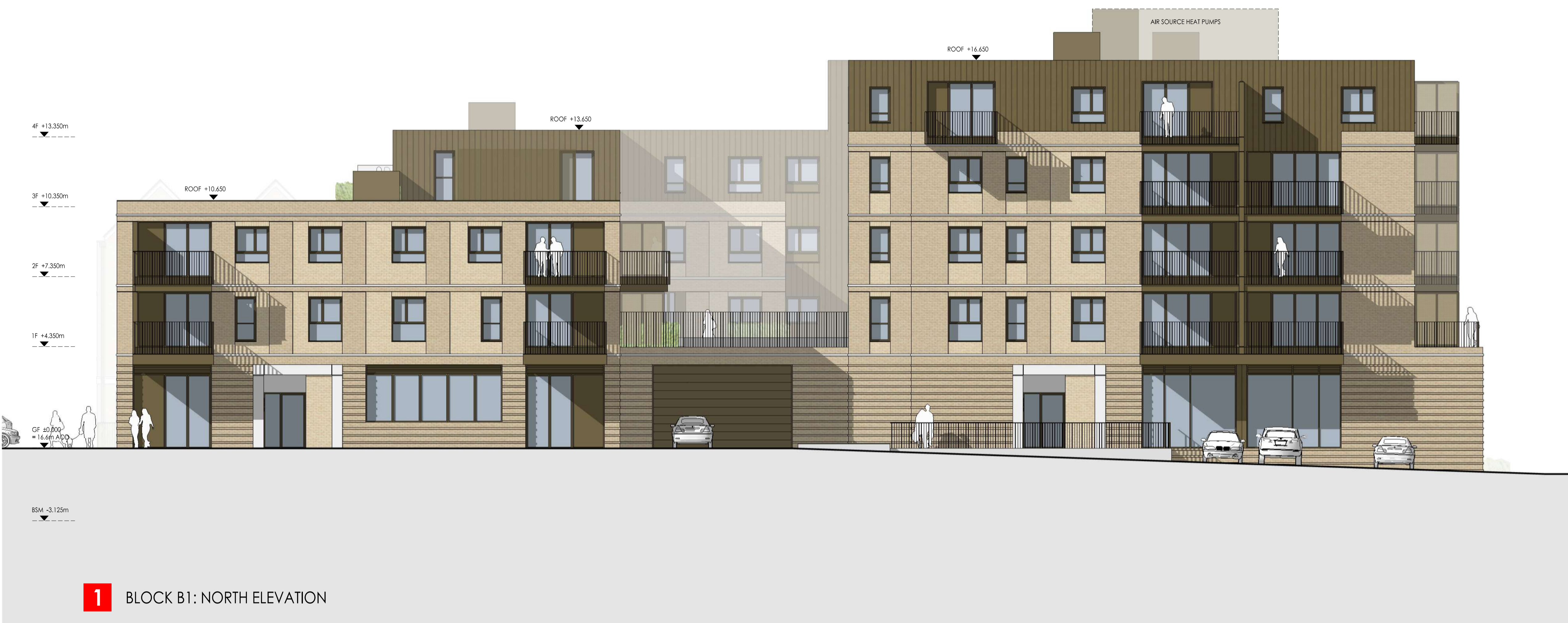
1 BLOCK B1: NORTH ELEVATION