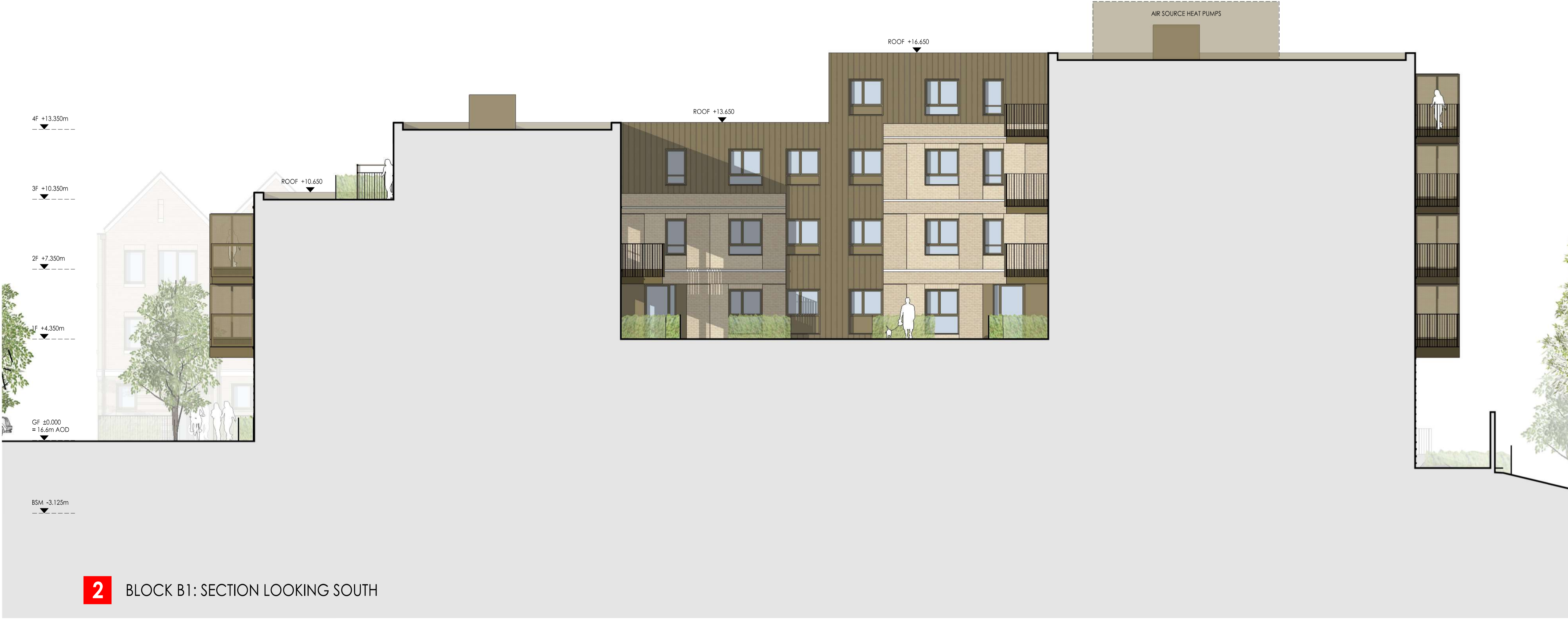
2 BLOCK B1: SECTION LOOKING SOUTH