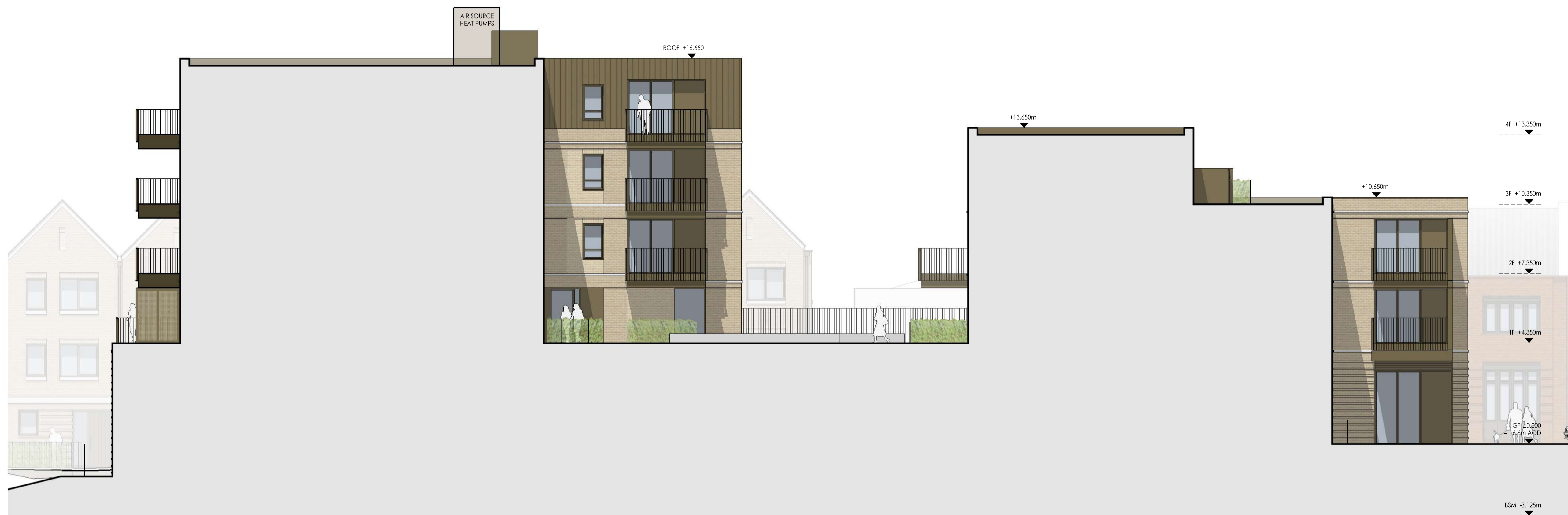
2 BLOCK B1: SECTION LOOKING NORTH